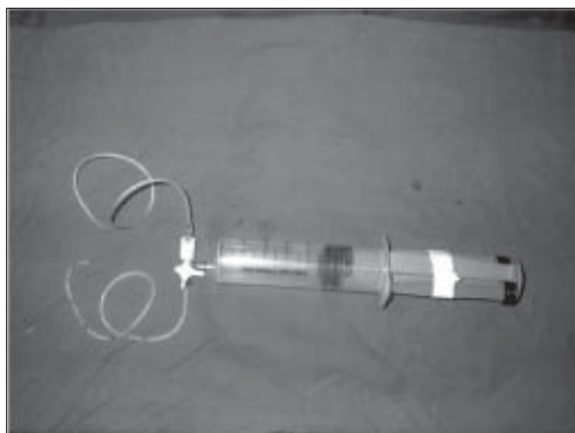
Figure 3: Equipment for the modified syringe suction drainage system: two infant feeding tubes, three-way cannula, 20/50 cc syringe, and two 10 cc pistons

need closed suction drainage (as described above) are Dupuytren's Contracture, Tendon transfers, concomitant bone harvesting from upper end of ulna and lower end of radius etc. However we do not recommend this method if one of the wounds is infected or potentially infected, for the fear of theoretical possibility of contaminating the non infected wound.