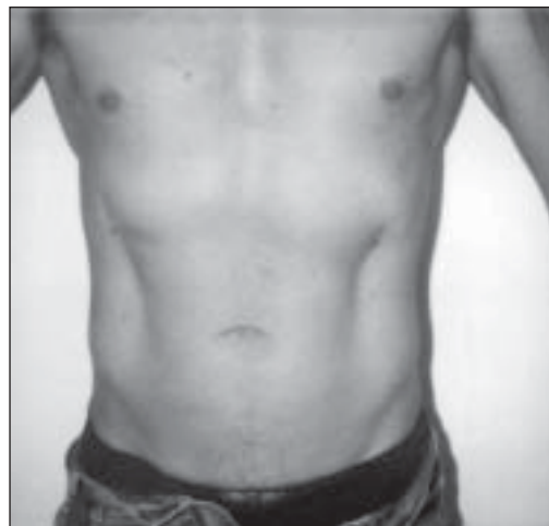
Figure 1B: Same Patient after treatment