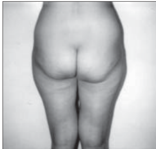
Figure 2A: Patient from the Viennese injection lipolysis study before treatment