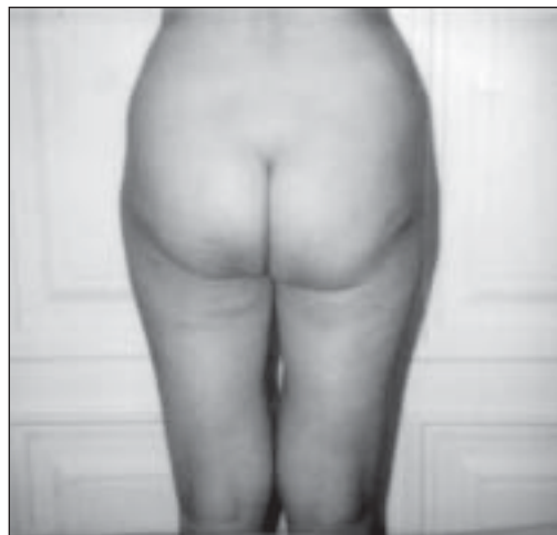
Figure 2B: Patient after injection lipolysis