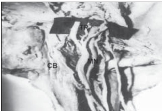
Figure 1: Photograph of the dissected right upper arm showing the lateral and medial roots of median nerve (MN). Note the third root (TR) joining the median nerve (MN). Absence of musculocutaneous nerve. Brachial artery (BR) and coracobrachialis muscle (CB) are also seen.

Type 5: The Musculocutaneous nerve is absent and the entire fibres of Musculocutaneous pass through lateral root and fibres to the muscles supplied by Musculocutaneous nerve branch out directly from Median nerve.