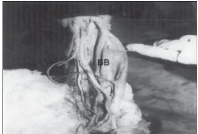
Figure 2: Photograph of the dissected right upper arm. Forceps is placed at the third head of the Biceps (BB).