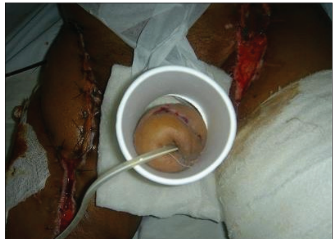
Figure 4: Shows ease of monitoring the flap from the top end