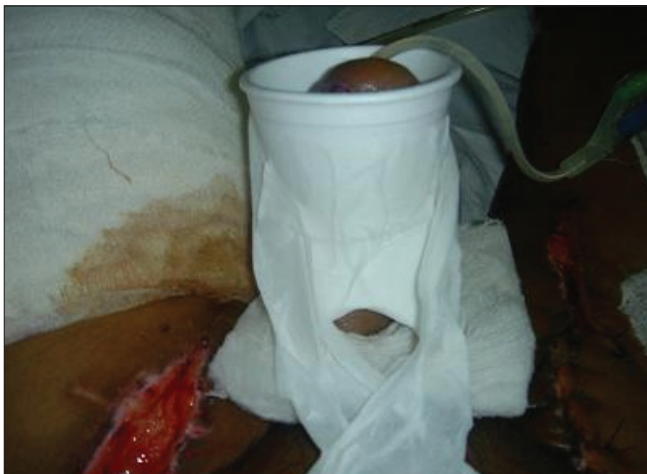
Figure 3: showing the visibility of the reconstructed penile base