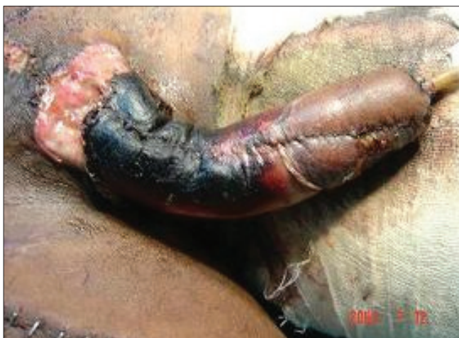
Figure 5: Survival of distal part, necrosis of skin in proximal part. This part could not be observed as there was no window. Subsequently the design was modified in its current form

centre of the splint (waist) along with light packing around the neo-penis was helpful in keeping the penis supported and prevented it from folding on itself. This loose packing avoided any impedance to venous drainage and allowed some space for the developing oedema. The tip of the flap could easily be seen and palpated for pulsation and temperature from the top open end [Figure 4]. At the time of dressing, removal of the splint was fairly easy - by simply removing the paper tapes used to fix it with the abdomen and thigh. The splint was usually kept for 2 weeks.