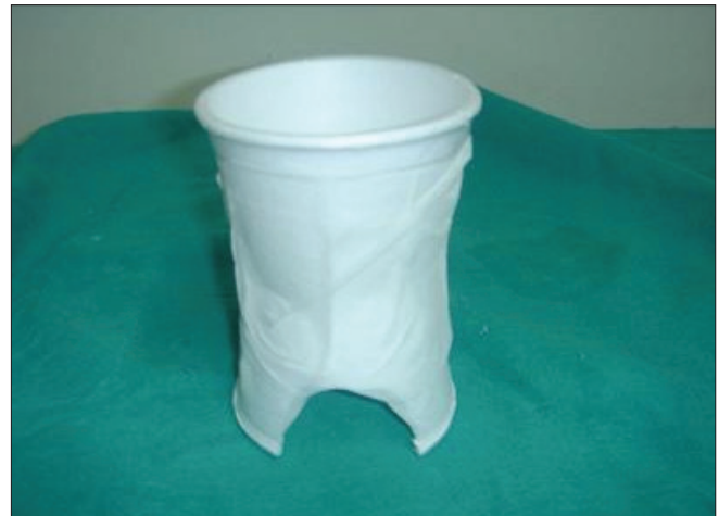
Figure 2: A fully constructed splint with the window at the base