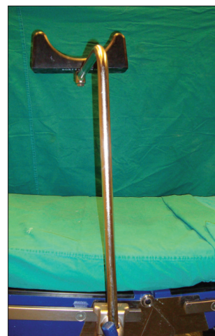
Figure 1: The top of the leg rest which resembles the top of the Dand