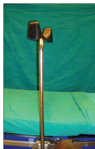
Figure 2: The leg rest mounted on the table and the top can be rotated 360°