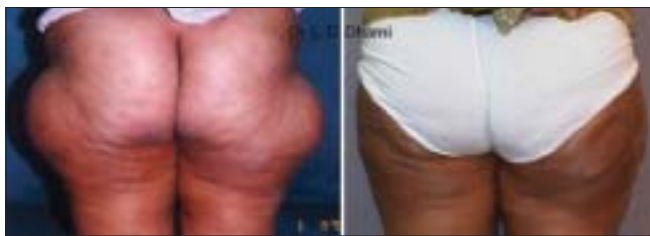
Figure 15: 43 year old female with Before & After SAL of 1500 ml from Bilateral Trochanteric region