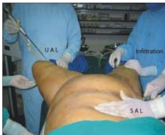
Figure 17: Team work - Simultaneous Infiltration, UAL & SAL by 3 surgeons leading to reduction in duration of surgery for large volume liposuction