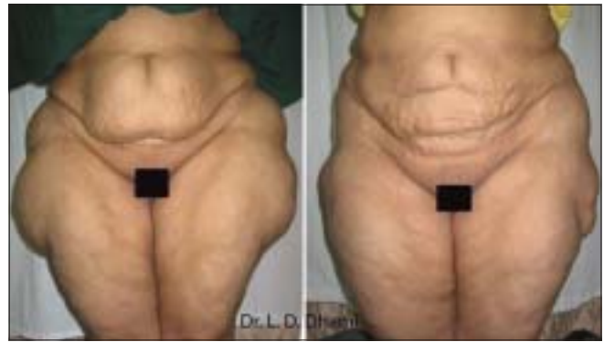
Figure 12: 55 years old Female with UAL of 8000 ml from Abdomen & Lateral Thigh (A) Before and (B) 1 year after

Tumescent liposuction has proven to be extremely safe even with the use of unprecedented large doses of the tumescent solution with dilute epinephrine, this produces intense widespread capillary constriction in the targeted fat, which in turn greatly delays the rate of absorption