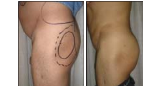
Figure 9: 48 year old man before & 1 year after SAL of Abdomen & Flanks. Fat was used as Transplant for Buttocks augmentation

shifting to the UAL, or by the beginner aesthetic plastic surgeon to minimize concurrent damage to the vital structures and damage to the overlying skin.