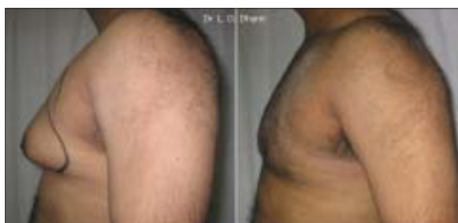
Figure 5: Pre and Post UAL Gynecomastia Combined Deep & Superficial LipoSuction