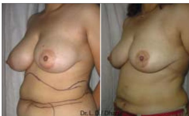
Figure 4: 20 year old unmarried girl SAL Breast 650 ml each side. Before & after 3 months. She also had UAL Abdomen in same session

Di Spaltro as the Chairperson, investigated Ultrasound Assisted Lipoplasty in 1995, evaluated the safety issues and provided inputs to the Food and Drug Administration (FDA) for its approval.