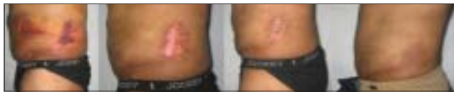
Figure 13: Complication. Ecchymosis, Superficial Skin necrosis after UAL & it's spontaneous resolution with conservative treatment over 6 weeks