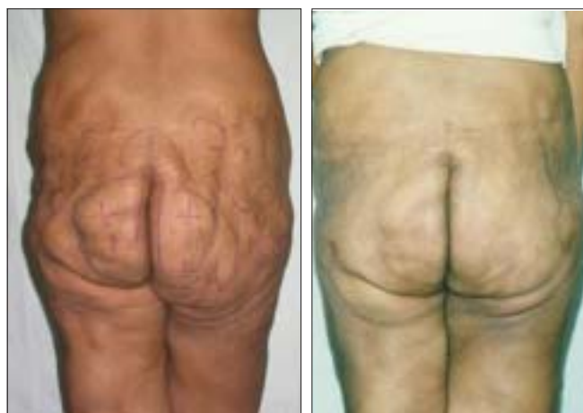
Figure 16: Complication: (A) Overzealous SAL, Scooping leading to ugly deformity. (B) Fat-filling done to correct

Microcannulae with an external diameter of 4mm can