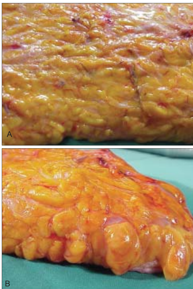
Figure 2: (A) Subcutaneous Fat, (B) Turgid Fat after Tumescent Infiltration