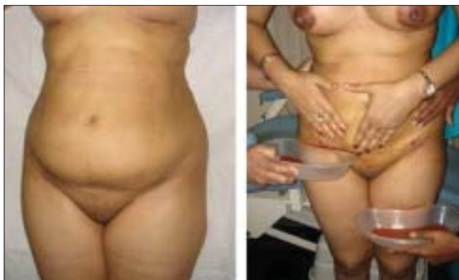
Figure 19: Complication: Large Seroma after UAL. 7th postop day. Drainage from incision site, left open for further drainage

Larger cannulae remove fat rapidly and there is a risk of removing too much fat and produce skin depressions and irregularities. An attempt to make a small change in the direction with a large canula results in a tendency to re-enter a pre-existing tunnel within the fat. This lack of precise control results in skin irregularities associated with the use of large cannulae. They are advocated only in those cases of LVL with access from sites from where the panniculus is to be sacrificed.