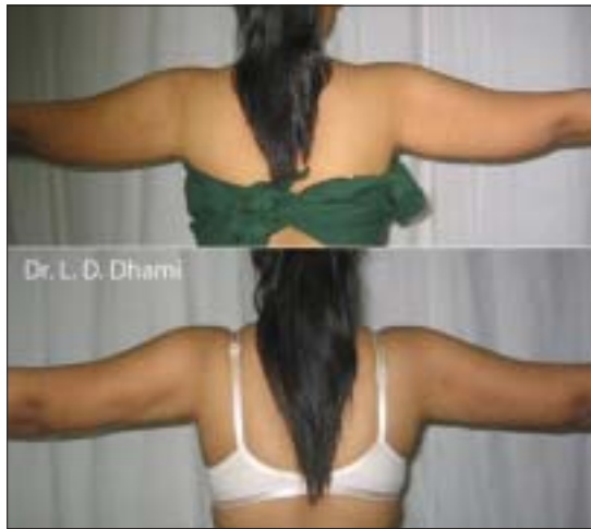
Figure 11: Before & 4 months after SAL of medial arms in 29 year old girl. Good Skin Contaction even with SAL alone