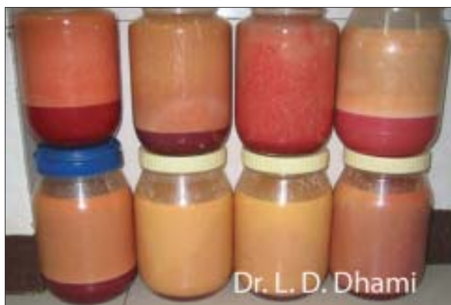
Figure 3: Total 24 litres of lipoaspiration with UAI & SAL combined including Fat + Wetting solution + Blood

Ultrasound is used as an ablative tool in urology and