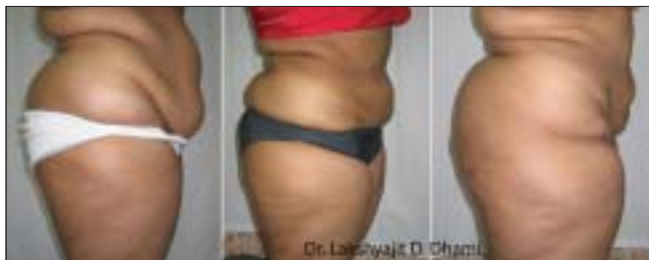
Figure 7: 27 years old unmarried girl with MALL ( massive all layer liposuction). Total 32,000 ml in 2 session (A) Pre operative (B) 5 months after UAL+SAL of Abdomen, antero-medial thigh & Medial Arms –Anterior Torso (14,000 ml) (C) 9 months after 2nd session of UAL+SAL from Back, Buttocks & PosteroLateral thigh – Posterior Torso (18,000 ml)

Caution is to be exercised in the learning curve when