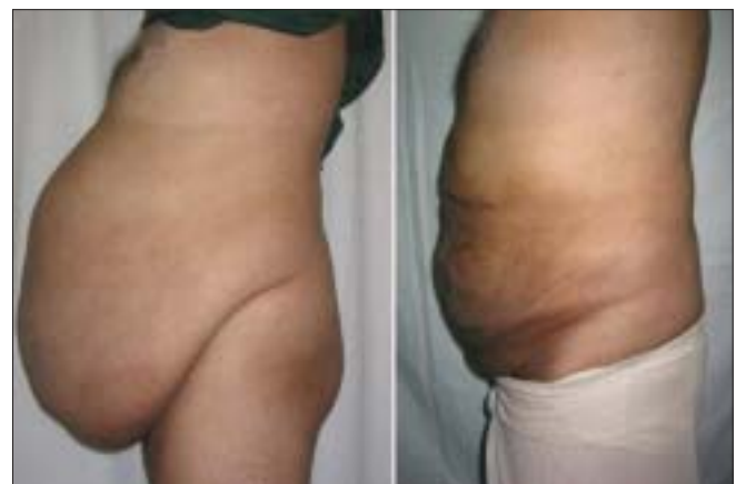
Figure 10: Before & 6 weeks After UAL of Abdomen. 47 year old man with MALL of 20,000 ml