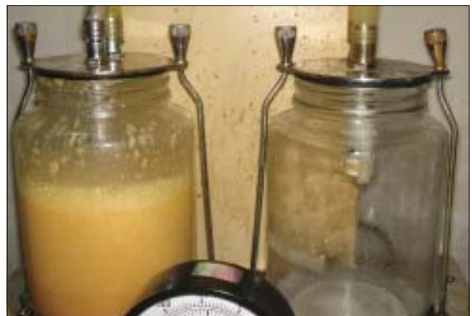
Figure 8: Yellow Fat aspiration with insignificant Blood after tumescent infiltration

Large adiposity of the abdomen, arms, or inner thighs tends to have excess volume of fat whose weight overstretches the panniculus and results in a ptosis of the skin overlying the area. In these cases the need is to reduce the large fat volume to permit effective skin retraction and MALL effectively addresses the issue better as the amount of