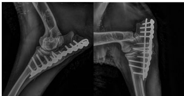
Fig. 3 Radiographs of the left elbow obtained 8 weeks postoperatively.

While conservative therapy may be an option in patients with olecranon fractures, ~90% and the vast majority of olecranon fractures in dogs 3 and horses, 19 respectively, have intra-articular involvement, and are therefore not amenable to the application of a cast or external fixation and require interfragmentary compression techniques. In a field setting, non-surgical management of ulna fractures may include the application of a Thomas splint-cast; however, disadvantages include possible significant injury to the contralateral limb due to increased weight bearing, bandage-associated sores and malunion. 11 Difficulties in patient activity restriction and bandage monitoring may increase the risk of splint or cast failure. An early return to weight bearing is also more commonly observed in patients with internal plate fixation than those managed conservatively. 15