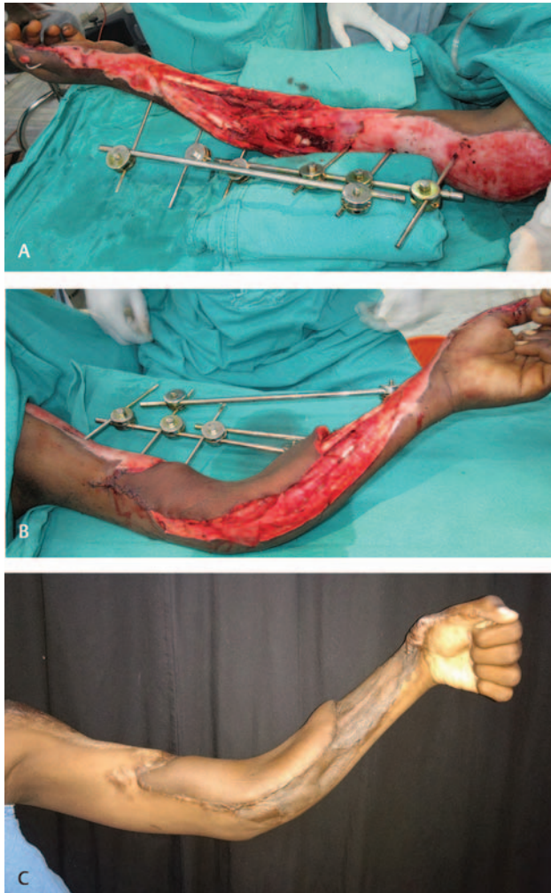
Fig. 2 (A) Debrided elbow wound extending to the forearm. (B) Anterolateral thigh flap coverage over elbow, proximal forearm, and distal arm: medial view. (C) Settled flap, good hand function, but with poor elbow movement.

All patients needed split skin grafting at the donor site; all except two donor sites healed primarily and these two needed secondary skin grafting.