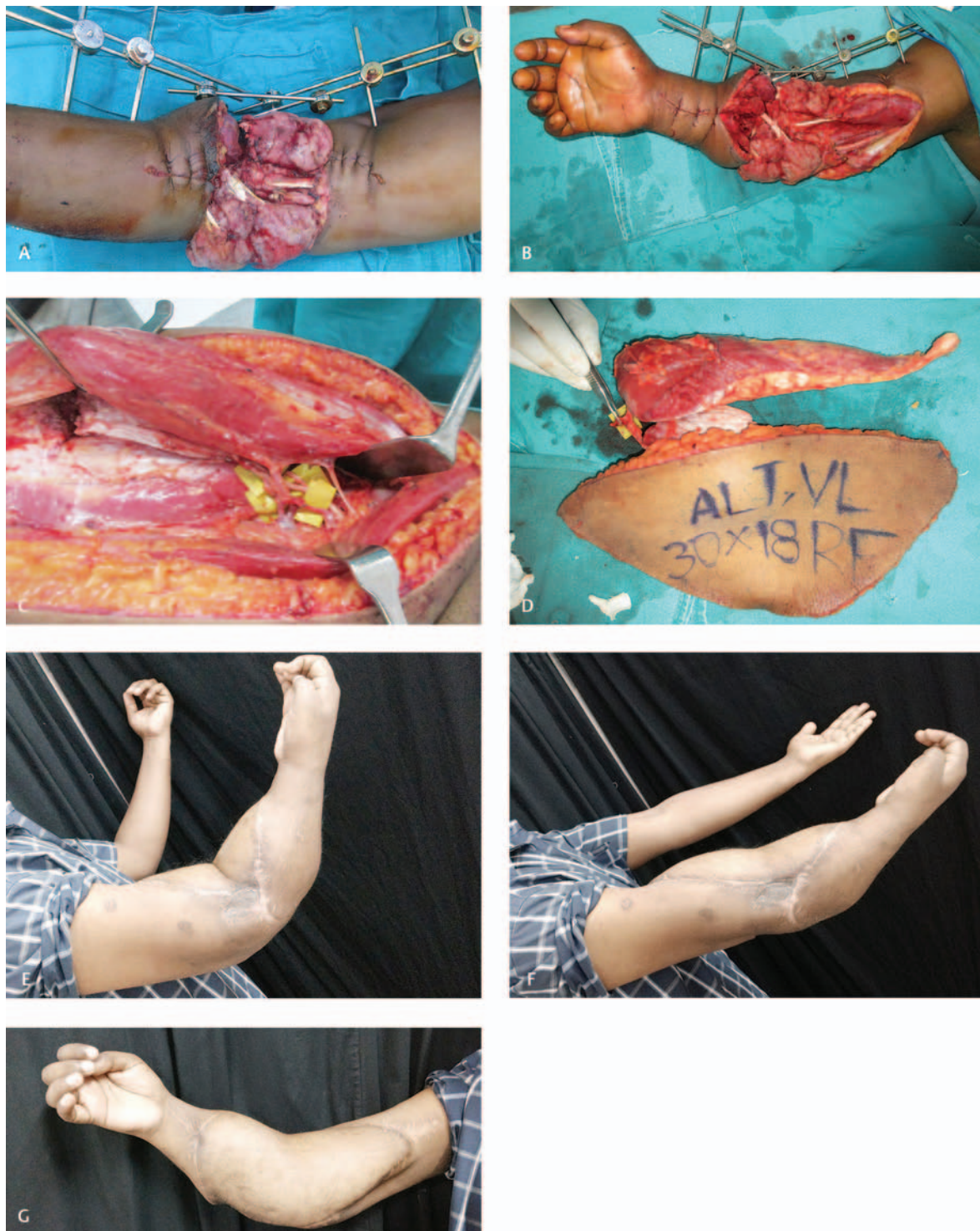
Fig. 4 (A) Wound over the right elbow with fracture in both forearm bones, referred after fixation. (B) Completion of debridement, loss of finger flexor muscles, and median nerve. (C) Composite flap of anterolateral thigh (ALT) and rectus femoris dissection completed. (D) Composite flap of ALT with vastus lateralis cuff and rectus femoris on a common pedicle. (E) Active range of motion (AROM) of the elbow joint: fair result. (F) AROM of the elbow joint: fair result. (G) Finger flexion by reinnervated rectus femoris muscle.

All total flap failures occurred in pedicled flaps. Significant distal necrosis occurred in 14% of pedicled latissimus dorsi muscle flaps; in all cases, these muscles were used to cover wounds that extended beyond the olecranon and over the proximal ulna. There were 10 secondary flaps performed for partial or total flap failures. Fifty percent of the salvage procedures were performed on pedicled latissimus