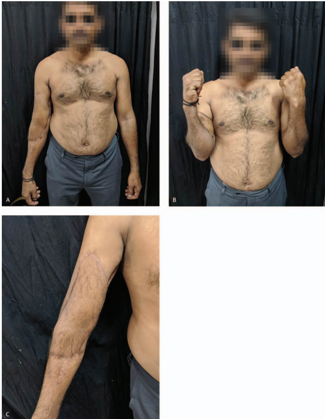
Fig. 5 (A) Active range of motion (AROM) of the elbow joint: excellent result. (B) AROM of the elbow joint: excellent result. (C) Settled anterolateral thigh flap after 8 months.

A smaller series was reported recently, specifically using free flaps for injuries of the elbow, by Chui et al for defects ranging from 3 to 450 cm 2 . 19 Three of the five patients with documented traumatic defects around the elbow underwent skeletal stabilization with or without concomitant nerve reconstruction prior to a free ALT flap anastomosed end to side to the brachial artery. The authors had no flap losses and