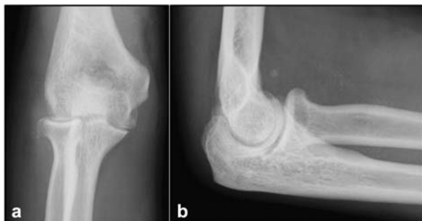
Fig. 1 Initial radiographs of the elbow: anteroposterior (a) and lateral (b) views.

The initial treatment was a long arm cast for immobilization. As the patient had no more pain after 7 days of immobilization, he stopped using the cast and returned to his job. Two months later, the patient performed a new radiograph, which showed consolidation with little deformity of the radial head and low degree of osteoarthritis (►Fig. 3a, b). However, just 6 months after that, the patient came to us with complaints of pain and limitation of movement. During the physical examination, the patient presented reduced range of motion (- 80° of extension and 110° of flexion) but had no important limitation to the forearm rotation. Then, the patient performed new radio-