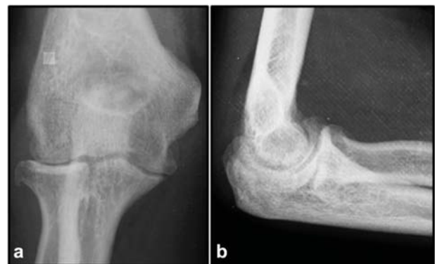
Fig. 3 Radiographs after 2 months of the injury showing fracture consolidation with little deformity of the radial head and low degree of osteoarthritis: anteroposterior (a) and lateral (b) views.