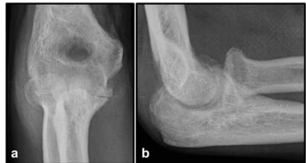
Fig. 4 Anteroposterior (a) and lateral (b) views of the elbow 8 months after the initial injury showing global and severe osteoarthritis.

graphs of the elbow that evidenced severe elbow osteoarthritis (►Fig. 4a, b). Then, he underwent arthroscopic debridement of the elbow, with an important improvement in the range of motion and pain.