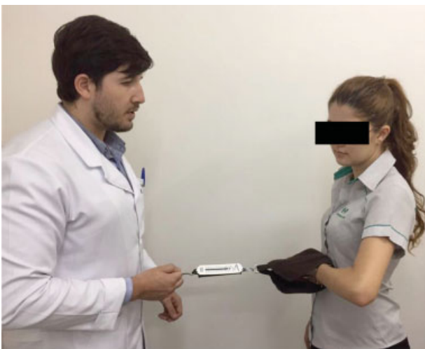
Fig. 1 Strength measurement at the belly press test.

Group A patients were submitted to an ultrasound examination to assess the integrity of the subscapularis muscle tendon, which was defined as normal tendon (► Figure 4A ), tendon with full thickness rupture not affecting the whole craniocaudal extension, or tendon with full extension rupture