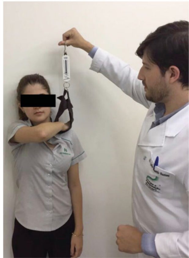
Fig. 2 Strength measurement at the bear hug test.