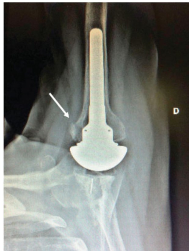
Fig. 3 Axillary lateral radiography showing lesser tuberosity healing after total shoulder arthroplasty.