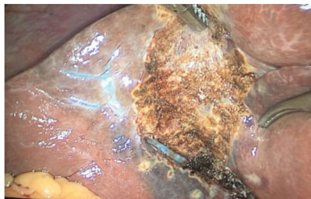
Fig. 2 Middle hepatic vein seen in laparoscopy.

Laparoscopic cholecystectomy has been established as the gold standard for the treatment of gallstone disease, but it can be associated with significant morbidity and mortality. 7 Bleeding complications are an important cause of mortality, especially when facing major bleeding during a laparoscopic procedure where the bleeding control can be technically challenging. Between 10 and 15% of patients will display a large branch of the middle hepatic vein adherent to the gallbladder bed, presenting an increased risk of vein injury during cholecystectomy. Excluding major vessels, bleeding can originate from the gallbladder bed itself, and the middle hepatic vein has been described to be a cause of uncontrollable bleeding. 4,8 Misawa et al reported that the branch of the middle hepatic vein was completely adherent to the gallbladder bed in 5 of the 50