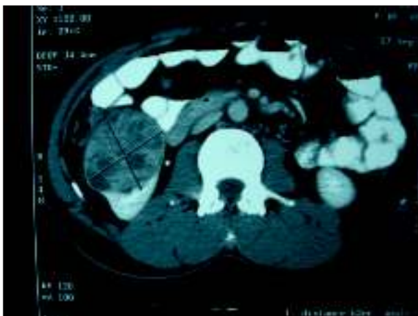
Figure 3 -C T image showing heterogeneously enhancing cystic mass in the lower pole of right kidney.