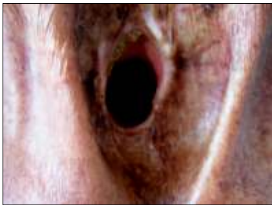
Fig 1 : Well healed stoma.