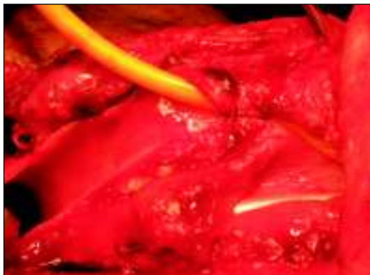
Fig 3 : Neopharyngeal stoma being constructed.