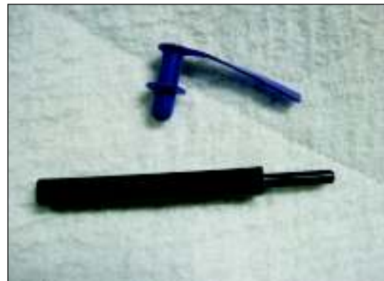
Fig 4: Tracheoesophageal prosthesis. (Nagpur prosthesis)