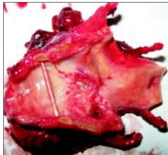
Fig 2: Laryngectomy specimen.