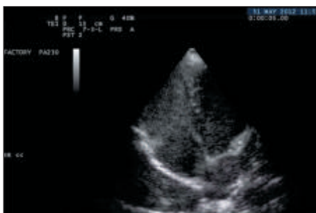
Figure 4 : 2D echo after few cardiac cycles showing bubbles in Left heart.