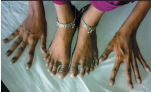
Figure 1 : Cyanosis and Clubbing of digits in both limbs.

echocardiography and computerised tomogram of chest revealed no abnormality in the heart and lungs. Contrast echocardiography revealed intrapulmonary shunts [FIGURE.3, 4].