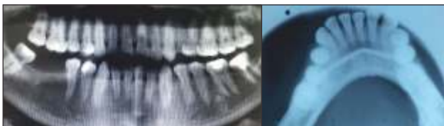
Figure 8a : Radiographic image-OPG Figure 8b : Occlusal view shows absence of calcified bodies