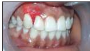
Figure 3 : Immediate post operative