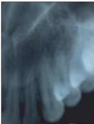
Figure 2 : Radiographic image.