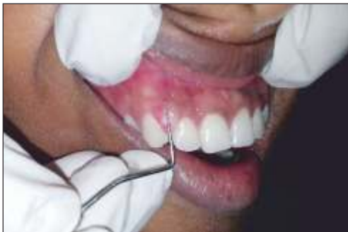
Figure 1 c : length