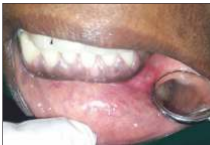
Figure 10 : Two-week postoperative picture