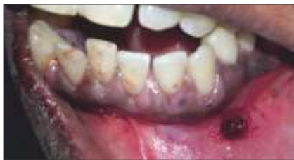
Figure 9 : Immediate post operative