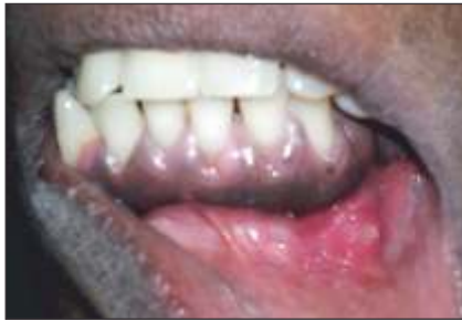
Figure 7 : clinical picture

The lesion was about 1 * 1 cm in size, pink in color, in region of alveolar mucosa and labial mucosa of 33,34. The lesion was soft in consistency and mobile. A radiograph of the area revealed no bony involvement (Figure 8a). An occlusal radiograph was taken to check for calcified bodies. (Fig 8b)