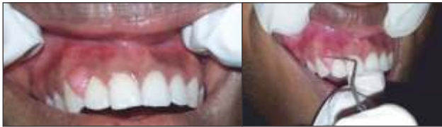
Figure 1a : clinical picture

7mm in size, pink in color, stippled on interdental papilla between maxillary lateral and canine. The lesion was mildly erythematous and firm in consistency. A radiograph of the area revealed no bony involvement (Figure 2).