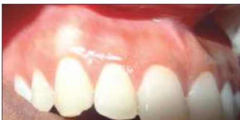
Figure 5 : 3 months follow-up

Phase I therapy with supragingival scaling was done. Patient was put on chlorhexidine mouthwash twice daily