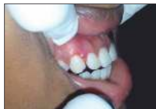
Figure 4 : Two-week postoperative pictures.