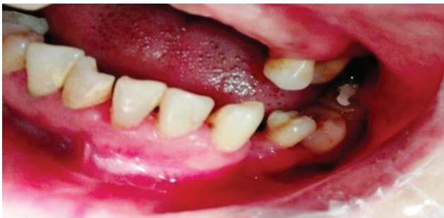
Fig. 7 Postoperative control at 60 days (side view).

with ibuprofen 400 mg/6 h/3 d, and oral rinsing with 0.12% chlorhexidine twice a day. After 10 days, the sutures were removed and the postoperative controls were performed at 15, 30, and 60 days, with the corrective treatment of the patient (► Figs. 6 and 7).