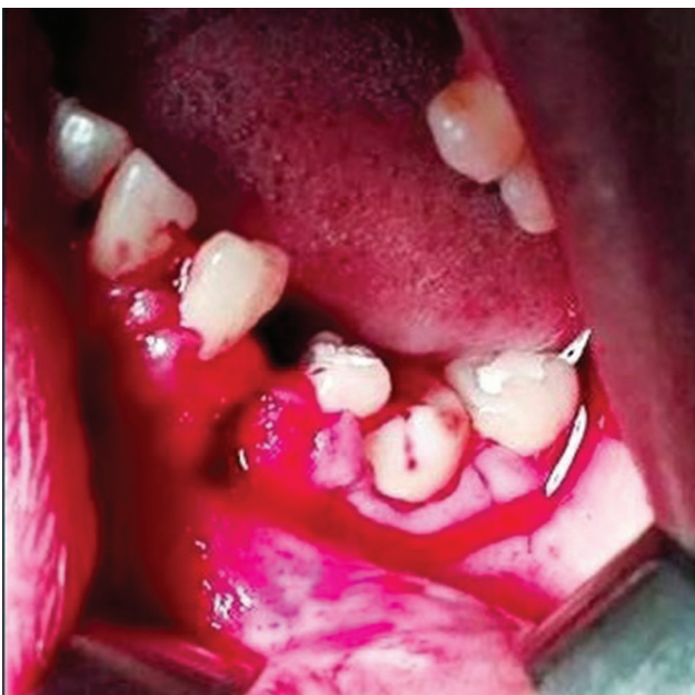
Fig. 3 Mucoperiosteal flap was performed with complete Neumann incision from 36 to 42, for the total excision of the granular ulcer secondary oral tuberculosis in all its extension projecting to 2 mm in healthy tissue adjacent to the area of the lesion. Check the edge of the flap is regular. The operative area was washed with sterile saline solution.

were provided and re-evaluated before and after surgical treatment.