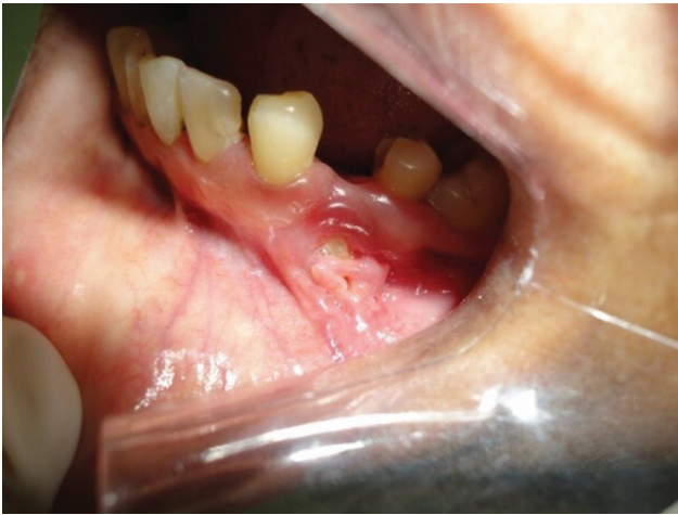
Fig. 1 The unusual granular ulcer that does not heal, chronic, of irregular appearance, with deep depression and located in buccal mucosa of the area premolar the left mandibular arch.