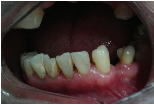
Fig. 6 Postoperative control at 30 days (front view).