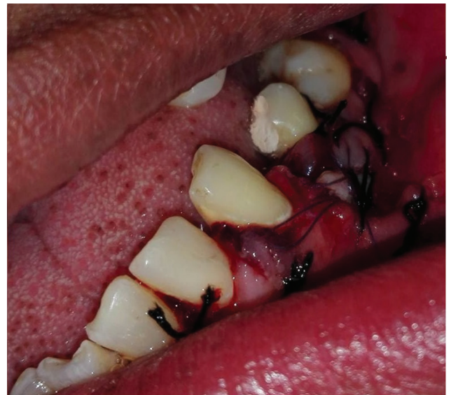
Fig. 4 Periodontal plastic surgery was performed in the area of the lesion. A sub epithelial connective autograft which was extracted from the palatal area and positioning in the area of the lesion.

The inferior dental nerve and the buccal nerve were anesthetized with 2% lidocaine with epinephrine 1: 80,000. After anesthesia, a mucoperiosteal flap was performed with complete Neumann incision from 36 to 42, incising crestally in the edentulous and intrasulcular zone in the dentate area proceeding to the total excision of the granular ulcer secondary oral TB in all its extension projecting to 2 mm in healthy tissue adjacent to the area of the lesion (► Fig. 3 ). Check that the edge of the flap is regular. The operative area was washed with sterile saline solution and consequently, periodontal plastic surgery was performed in the area of the lesion positioning a subepithelial connective autograft, which was extracted from the palatal area (► Figs. 4 and 5 ). Erythromycin 500 mg/6 h/10 d was prescribed along