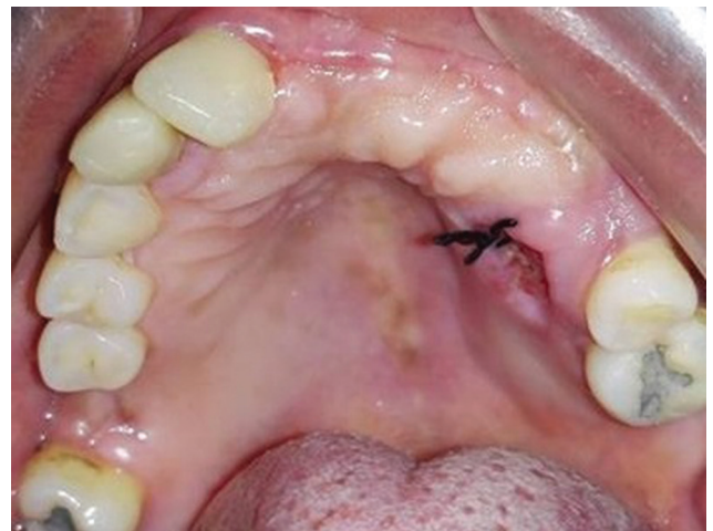
Fig. 5 Palatal donor area of the sub epithelial connective tissue with suture.