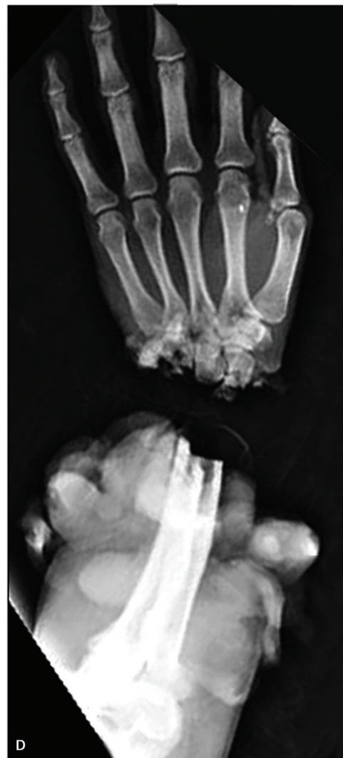
Fig. 1 Clinical photographs of the injured (a) left upper extremity with segmental loss of metacarpals and near total loss of palmar soft tissue and (b) right upper extremity with amputation through the proximal third of forearm with loss of middle and distal third of forearm. Preoperative radiographs (c), (d) displaying the same.