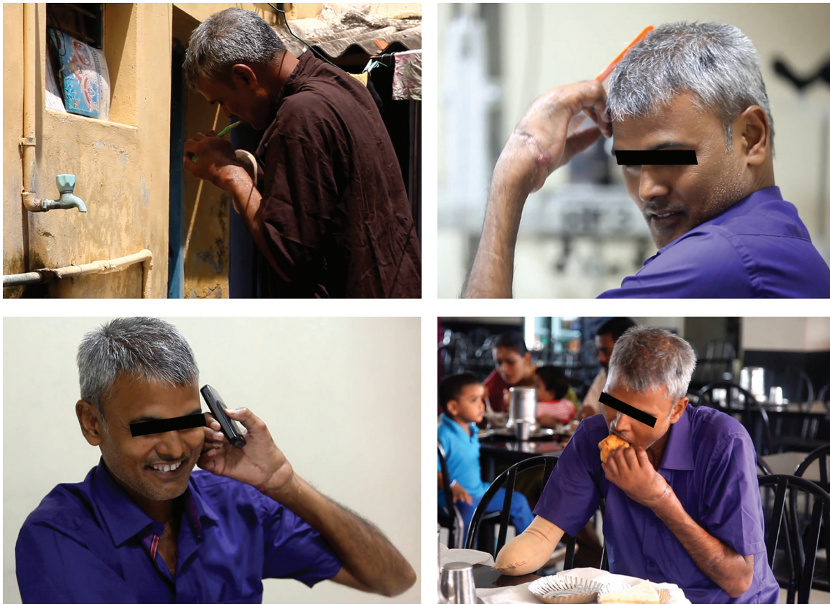
Fig. 4 Postoperative clinical photographs showing the patient brushing his teeth, combing his hair, using a cell phone, and eating.