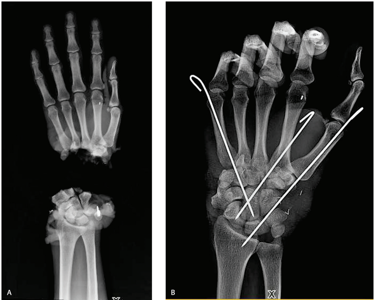
Fig. 2 (a) Intraoperative plain radiograph showing the proposed transfer of the right hand onto the left wrist prior to replantation. (b) Postoperative plain radiograph showing the K-wire fixation after cross-hand replantation. (c) Intraoperative clinical photograph showing the proposed transfer of the right hand onto the left wrist prior to replantation. (d) Intraoperative clinical photograph showing anastomosis of the proximal radial artery to the distal ulnar artery with an interpositional vein graft (white arrow), coaptation of the respective motor and sensory branches of the ulnar nerve (black arrow), and coaptation of the median nerve (yellow arrow).