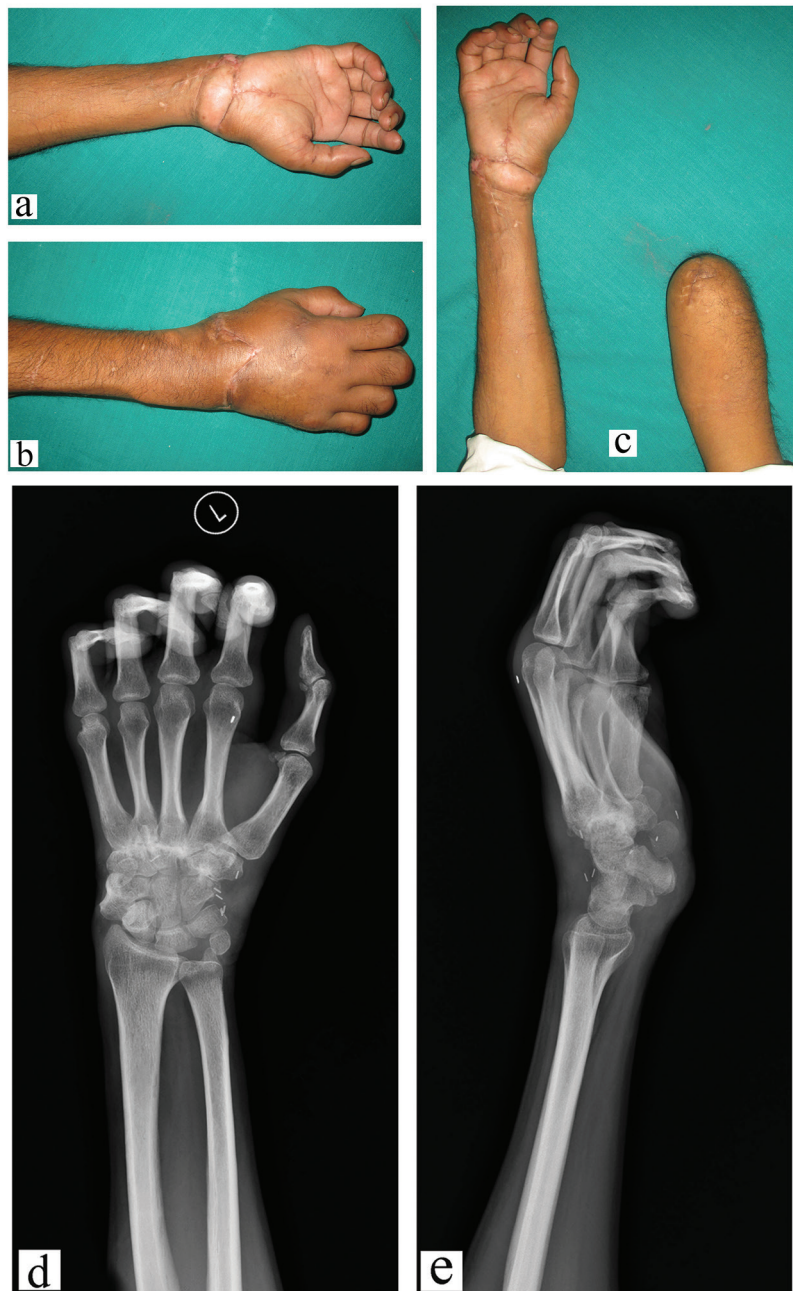
Fig. 3 Postoperative clinical photographs (a–c) and plain radiographs of the cross-hand replantation (D, E).