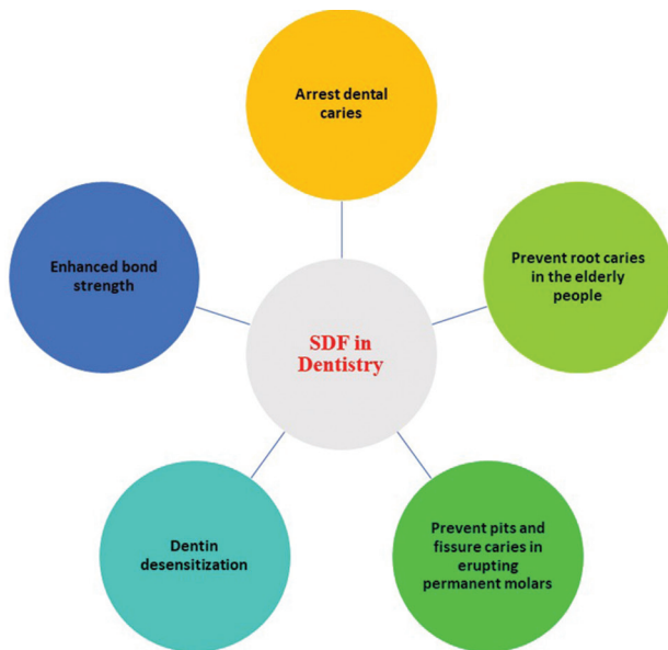
Fig. 1 Application of SDF in dentistry. SDF, silver diamine fluoride.