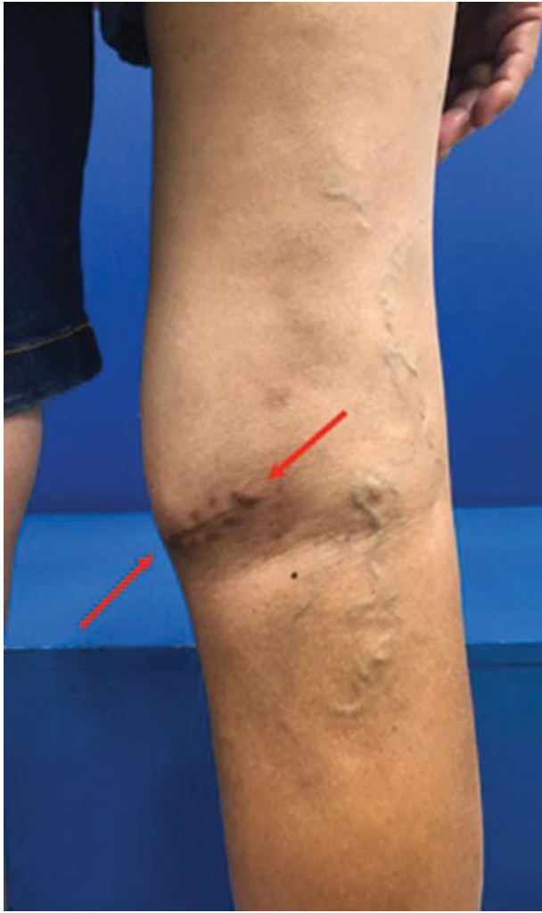
Fig. 2 Photo of the same patient in ► Figure 1 . Posterior region of the right knee of a patient submitted to an open biopsy with inadequate access route. It's possible to observe a transverse scar that will need to be completely resected. Skin closure may be compromised.

Despite the attempts to avoid unnecessary biopsies, this procedure is still indicated for the vast majority of patients. The material for anatomopathological examination must be evaluated by a pathologist with experience in musculoskeletal tumors. Currently, pathologists supplement their histopathology analysis with a panel of immunohistochemical markers. Molecular tests have been used to supplement the diagnosis. Regardless of the need to molecular testing to support certain diagnoses, the detailed genetic analysis of the tumor tissue of a patient may have important implications in the therapy. 27 Techniques such as Fluorescent In Situ Hybridization (FISH) and Next Generation Sequencing (NGS) are slowly showing the existence, within the same diagnosis, of different subtypes of tumor, with patterns which are often similar and which will probably need target therapies for their treatment, probably generating a positive impact on survival. 2,27