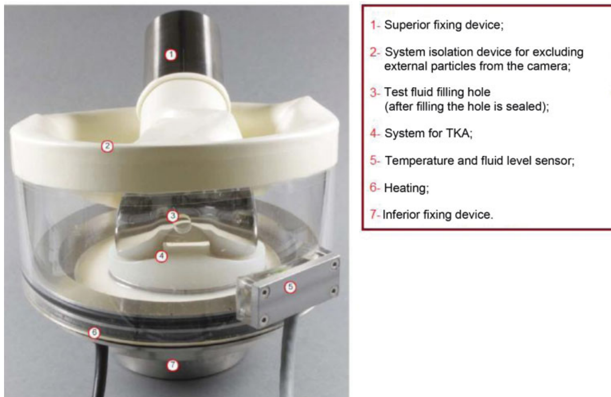
Fig. 1 Representation of the individual test chamber.