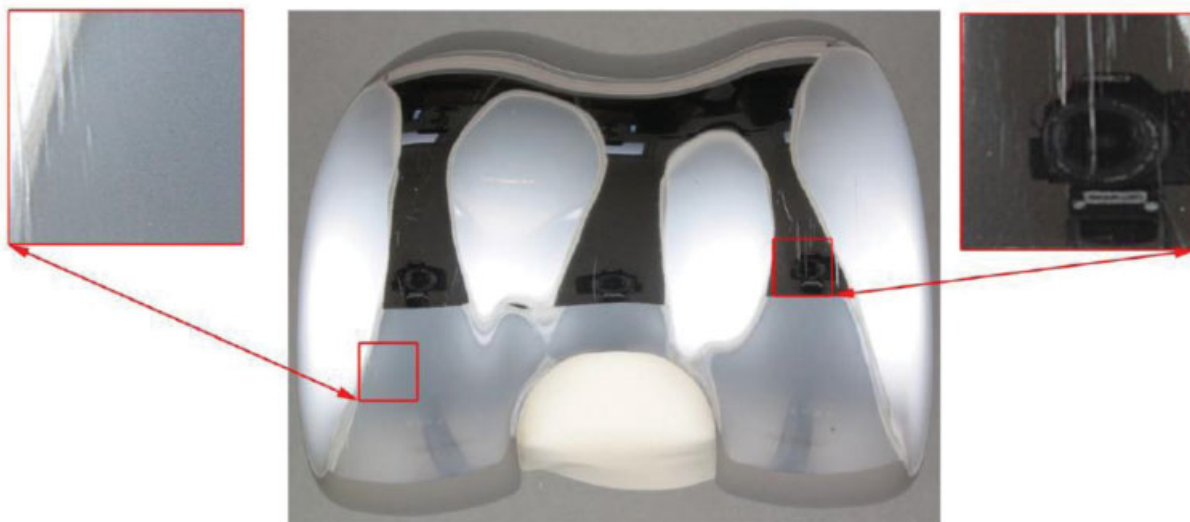
Fig. 2 Qualitative virtual analysis of the wear.

standardizing the contact pressures between components, thus reducing the formation of polyethylene particles and, consequently, osteolysis, in addition to the better adaptation of the extensor mechanism to possible imperfections in the rotational positioning of the tibial component. 11 An in-vivo video-fluoroscopic study, followed by three-dimensional reconstruction of the images obtained, comparing prostheses with fixed and mobile bases, with the same origin and design, showed that the femorotibial contact