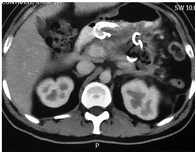
Fig. 1 Contrast-enhanced CT abdomen: Two 7 Fr 3 cm double pigtail plastic stents seen in situ after resolution of WON. Abbreviation: WON, walled-off necrosis.