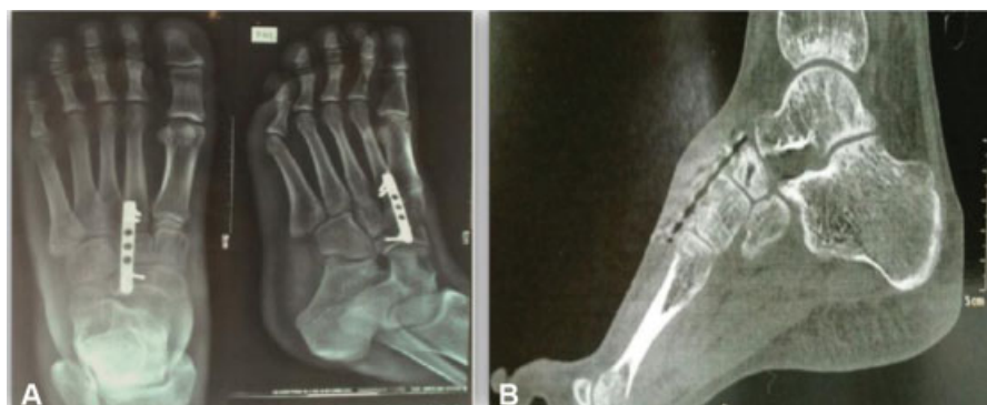
Fig. 4 Imaging tests performed six months after surgery. We evidenced incorporation of the bone graft. (A) Radiography. (B) Computed tomography.

The patient showed excellent evolution, underwent physical rehabilitation with return to sports activities without complications. Three months after the second surgery, the patient was already practicing light running and exercises without impact at the gym.