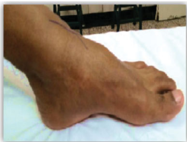
Fig. 1 Foot photograph in profile. Edema is noted in the dorsal region of the midfoot associated with an increase in the medial plantar arch.