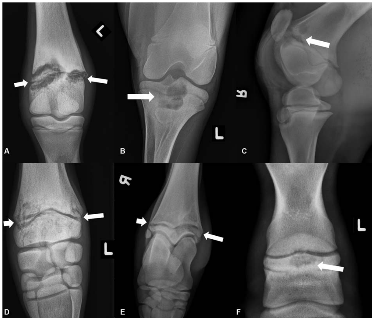
Fig. 1 Radiographic examples of septic physisitis in foals in varying anatomical physes with a brief description of the physal lesions (arrows are pointing the abnormal lesions). (A) Dorsoplantar projection, distal third metatarsus (severe extensive lysis throughout the physis that extends into the metaphysis and epiphysis), 1-month-old Thoroughbred colt; (B) craniocaudal projection, proximal tibia (severe focal lysis centred on the mid physis that extends into the metaphysis and physes), 1-month-old Pony of America filly; (C) lateromedial projection, distal femur (variable mild to moderate focal lysis in the cranial physis that extends into the metaphysis and epiphysis), 3-week-old Thoroughbred colt; (D) dorsopalmar projection, distal radius (variable mild to moderate ill-defined lysis throughout the physis that extends into the metaphysis and epiphysis), 2-week-old Thoroughbred filly; (E) dorsoplantar projection, distal tibia (variable mild lysis throughout the physis, worse medially, that extends into the metaphysis and epiphysis), 2-week-old Quarter Horse colt; (F) dorsopalmar projection, proximal middle phalanx (moderate focal lysis centred region of the mid physis that extends into the metaphysis and epiphysis), 3-month-old Thoroughbred colt.

but distant from the region of septic physisitis. Synovial fluid obtained from the affected synovial structures was seroanguineous and/or turbid in all affected cases. Culture of synovial fluid was submitted in four of eight foals, with positive growth ascertained in one case ( Streptococcus zooepidemicus ). Non-musculoskeletal systemic co-morbidities were present in 4 of 10 foals, with two having clinical symptoms of colitis/diarrhoea, one having pneumonia and other having an umbilical abscess confirmed on ultrasonography and resected at surgery.