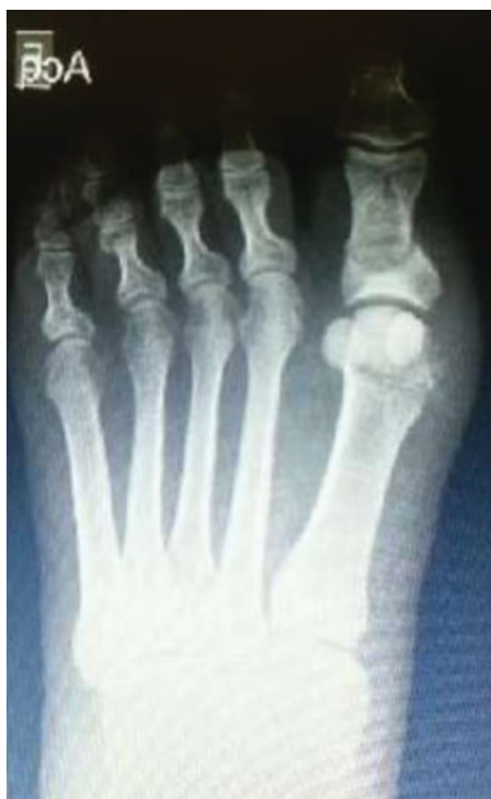
Fig. 3 Reverdin-Isham (RI) technique associated with exostectomy, tenotomy and Akin osteotomy.

The bandage is made with gauze and adhesive tape, keeping the toe in a neutral position with 10° of flexion. The tapings were changed weekly, for 4 weeks, and immediate loading with rigid shoes was allowed as tolerated. When the pathology was bilateral, the patients were operated on both feet. Angular measurements were taken and questionnaires were applied at six weeks, six months and one year.