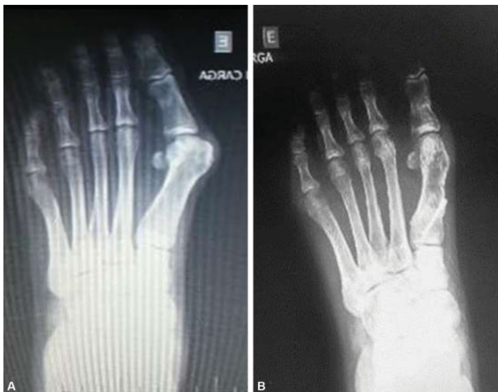
Fig. 9 (A) Pre-operative severe halux valgus; (B) post-operative Ludloff-like osteotomy.