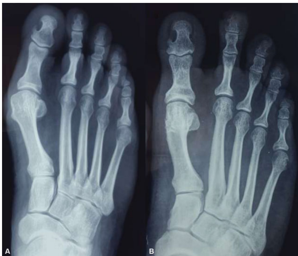
Fig. 6 (A) Pre-operative mild case; (B) pos-operative (exostectomy + distal soft tissue release + Akin) mild case.

1 year, and 1 broken burr that could not be removed. Two patients presented a symptomatic callus, caused by dorsal dislocation of first metatarsal head (1 RI and 1 PPOF), there was 1 recurrence in less than 1 year (PPOF), and 1 non-transient neuropathy (DSTR-AKIN). These represent 18% of all cases. The percentage of complications was proportionally higher in the severe cases (33%; PPOF) followed by the moderate cases (18%; PCH), intermediate cases (17.6%; RI), and mild cases (12%; DSTR-Akin).