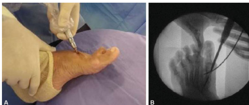
Fig. 5 (A) Position of the burr to perform the Ludloff osteotomy; (B) fixation of the osteotomy with one screw. A Kirschner wire is used to help translate the metatarsal head.

The average follow-up was of 17.2 months (range: 12 to 36 months). The mean preoperative HVA was of 35.1^\circ (range: 13^\circ to 51^\circ ); postoperatively, it was of 12.3^\circ (range: 0^\circ to 28^\circ ). Therefore, a mean correction of 22.8^\circ was obtained, with the difference being statistically significant ( p < 0.05 ). The mean preoperative IMA was of 13.7^\circ ( 6^\circ - 23^\circ ) and of 9.3^\circ ( 5^\circ to 19^\circ ) postoperatively, with a mean correction of 4.4^\circ ( p < 0.05 ). The mean preoperative AOFAS was of 49.2 (34 to 60), and, at the last follow-up, it was of 88.6 (45 to 100), with a mean increase of 39.4 points ( p < 0.05 ).