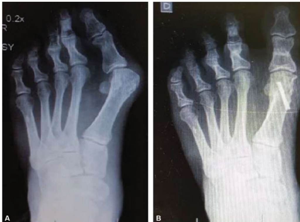
Fig. 8 (A) Pre-operative moderate case with articular incongruence; (B) post-operative percutaneous chevron.