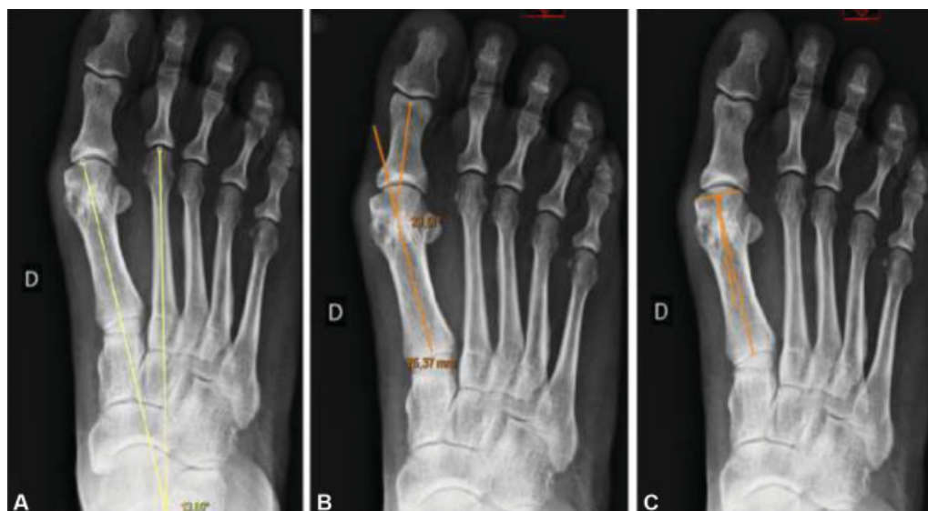
Fig. 1 Angular measurements. (A) Hallux valgus angle (HVA); (B) intermetatarsal angle (IMA); (C) distal metatarsal articular angle (DMAA).

In mild to moderate deformities with altered DMAA, we performed the Reverdin-Isham 1,3 (RI) technique. We performed exostectomy as previously described, followed by osteotomy using the same approach. We introduced a Shannon burr from dorsal to plantar at 45 degrees of lateral