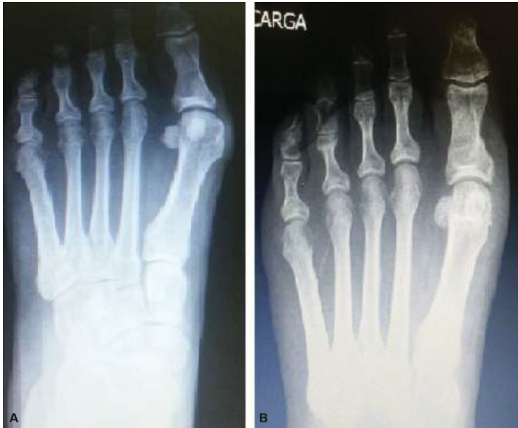
Fig. 7 (A) Pre-operative moderate case with altered DMAA; (B) post-operative RI procedure with exostectomy + tenotomy + Akin.