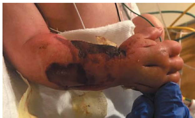
Fig. 2 Right forearm and hand after fasciotomies and carpal tunnel release.

Postoperatively, right brachial, radial, and ulnar blood flow were all detected via Doppler. A brain magnetic resonance imaging/magnetic resonance angiography/magnetic