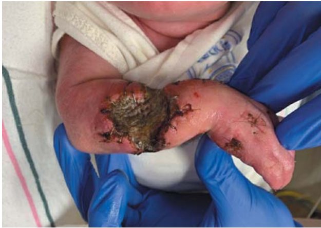
Fig. 3 Right forearm after second debridement and allograft placement and distal third, fourth, and fifth digit amputations.