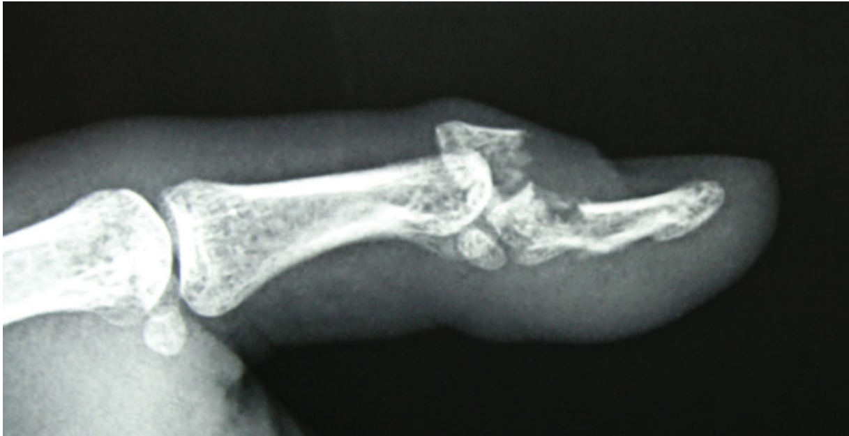
Fig. 1 A displaced comminuted intra-articular fracture of the terminal phalanx of the left thumb. The dorsal fragment included more than 50% of the interphalangeal articular surface attached to the extensor pollicis longus tendon and is displaced dorsally producing a bony mallet thumb lesion.