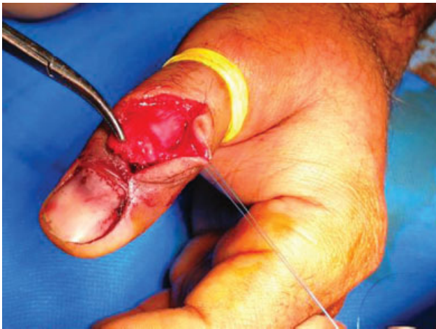
Fig. 2 Under digital block and digital tourniquet and after the skin incision, there was a relatively large osseous fragment lying on the proximal part of the nail plate. The nail plate was interposed between the dorsal and palmar fragments.

osseous fragment attached to the EPL tendon lied on the proximal part of the nail plate, and the nail plate was interposed between the dorsal and palmar fragments (► Fig. 2 ). The fragment was fixed with a 2-mm miniscrew. The thumb's IP joint was immobilized with a spica cast for 6 weeks and then the range of motion related exercises were initiated (► Figs. 3 and 4 ). Eighteen months postsurgery, the IP joint was stable, and active range of motion was 0 extension to 45-degree flexion without extension lag with no nail deformity (► Fig. 5 ). The thumb radiographs demonstrated full extension of the IP joint with no gap at the articular surface, and all the bone fragments were consolidated (► Fig. 6 ). The patient was satisfied with the functional outcomes.