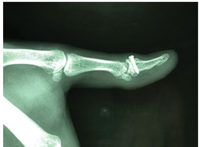
Fig. 6 Eighteen months postoperative lateral radiograph demonstrating the full extension of the thumb's interphalangeal joint. There was no gap at the articular surface. All the bone fragments were consolidated.

Compared with a mallet finger, a mallet thumb is an uncommon lesion since the thumb is shorter than the other fingers and its EPL is thicker than the terminal tendon of the extensor mechanism of the other fingers. 4,7,8 The bony mallet thumb is an even rarer lesion. 3 A bony mallet finger refers to an avulsion