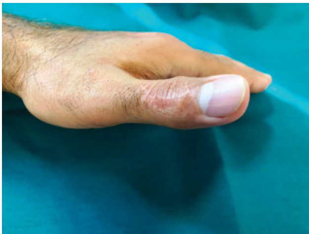
Fig. 5 Eighteen months postoperative clinical photography demonstrating the active full extension of the thumb's interphalangeal joint without nail deformity.