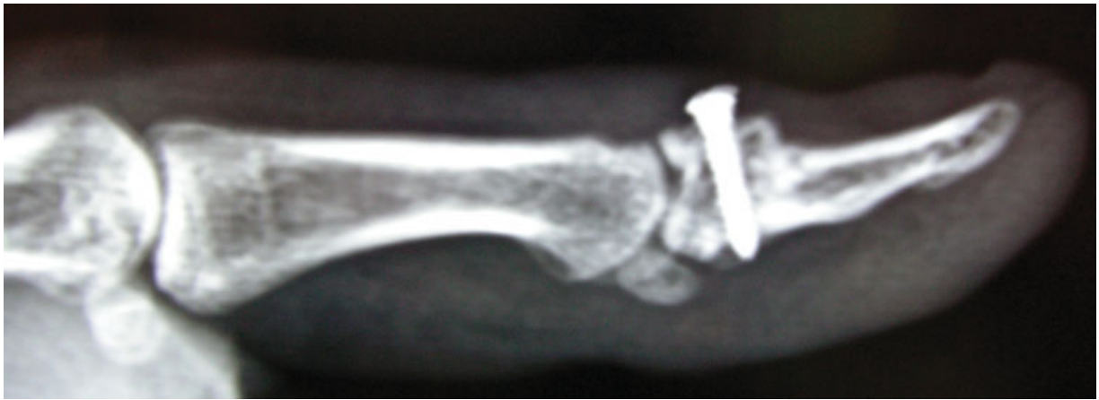
Fig. 3 Six months postoperative lateral radiograph.