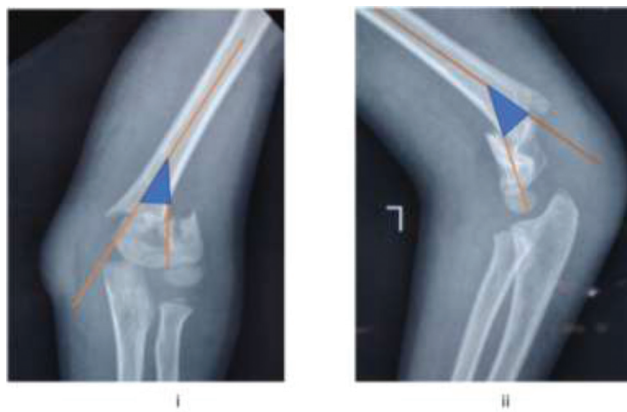
Fig. 1 (i, ii). Depiction of angulation in the coronal (i) and sagittal planes (ii) by lines along the mid diaphysis of the proximal fragment and a line perpendicular to the elbow joint in the distal fragment.

Age, gender, laterality, mode of injury, injury hospital duration, history of previous attempts of closed reduction, open/closed fracture, and distal neurovascular status were determined by reviewing the medical records.