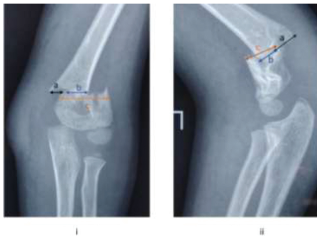
Fig. 2 (i, ii). Depiction of translation and osseous apposition in the coronal (i) and sagittal planes (ii). Translation = a/c . Osseous apposition = b/c .

Data were analyzed using chi-squared tests or Fisher exact tests for categorical variables and the sample t-test for continuous variables. Odds ratios (ORs) were estimated and reported with associated 95% confidence intervals (CIs). ROC curves were exploited for comparison of the diagnostic performance of various radiographic parameters