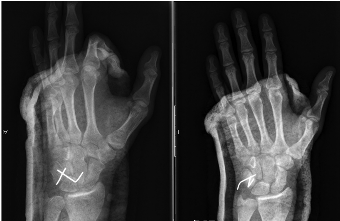
Fig. 3 Immediate postoperative radiograph demonstrating the anatomical reduction of the pisiform and its fixation to the triquetrum bone with Kirschner wires.