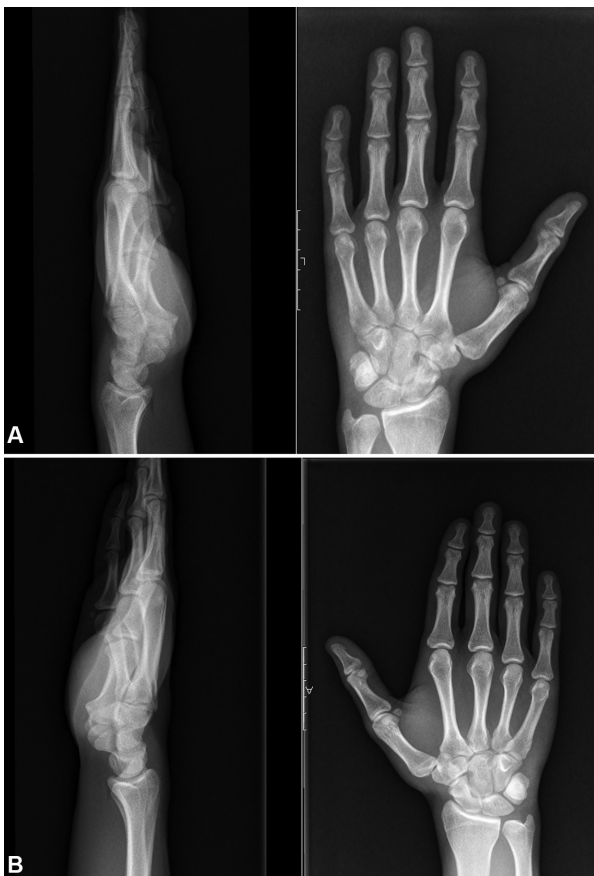
Fig. 4 (A) Radiograph of the left wrist at 12 weeks postoperatively, revealing the sustained pisiform reduction; (B) Radiograph of the right wrist.

was started. At 12 weeks postoperatively, a follow-up radiography showed the pisiform in its native position (→ Figure 4 ). At 12 months postoperatively, the patient recovered the wrist's complete range of motion, presenting symmetrical muscle strength and no residual pain (→ Figure 5 ). In addition, the Disability of Arm Shoulder and Hand (DASH) and the Patient-Rated Wrist Evaluation (PRWE) scores were equal to 0.