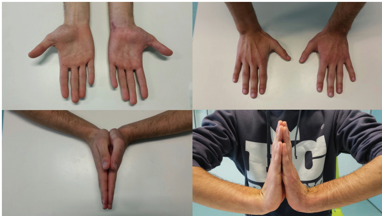
Fig. 5 Photograph of the patient demonstrating a symmetrical range of motion.

The FCU, as the main wrist flexor muscle, tends to displace the pisiform proximally. Thus, pisiform proximal dislocation is the most frequent type observed, due to the overlap of forces from the FCU and other stabilizing structures. 5