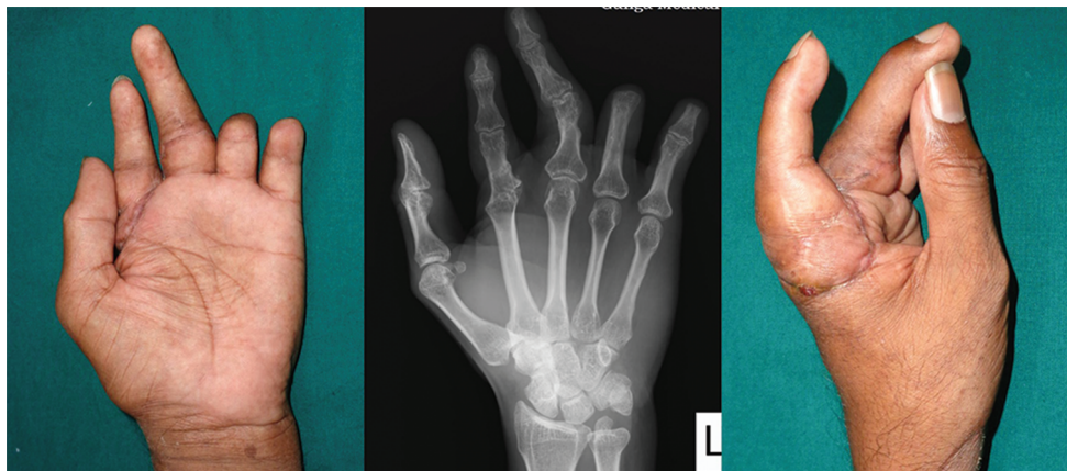
Fig. 4 Clinical photos and radiograph at 19 months following second replantation. Radiograph shows good fusion at the metacarpophalangeal (MCP) joint of index and bone union at the proximal phalanx of the middle finger. Patient was using the hand well with the middle finger and thumb opposition pinch.