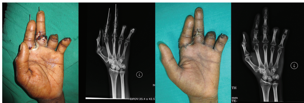
Fig. 2 Clinical photo and the corresponding radiograph at 2 weeks and 6 weeks postreplantation.