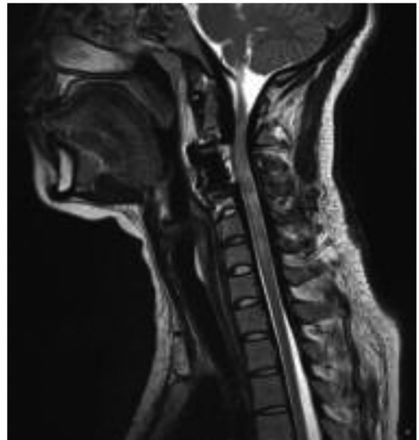
Fig. 2 Magnetic resonance imaging after corpectomy of C3 with anterior arthrodesis of C2–C4 and laminoplasty of C3–C6 levels.