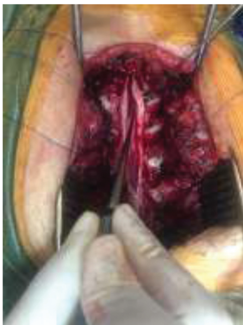
Fig. 4 Hypertrophy of the meninge after durotomy.