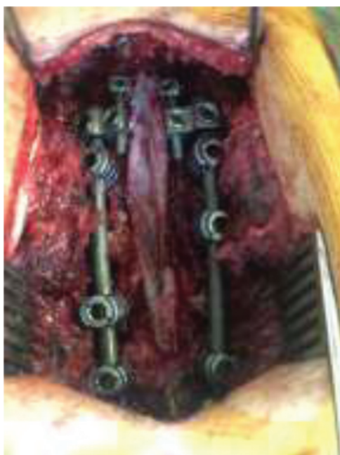
Fig. 5 Final aspect after duraplasty + posterior arthrodesis of C7–T5.

mater. 1,2 It may be idiopathic or secondary to systemic diseases, such as sarcoidosis, tuberculosis, fungal meningitis, rheumatoid arthritis, carcinomatosis, among other inflammatory diseases.