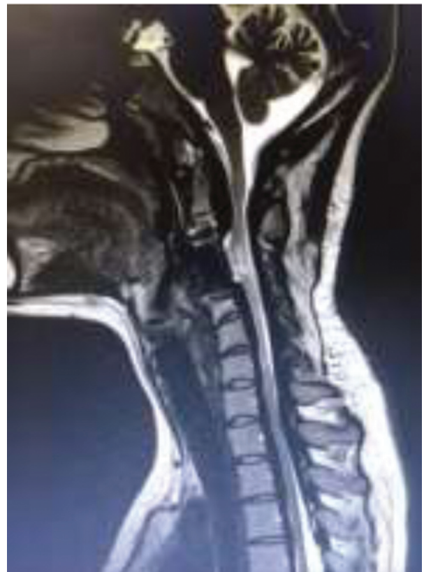
Fig. 3 Cervicothoracic stenosis.