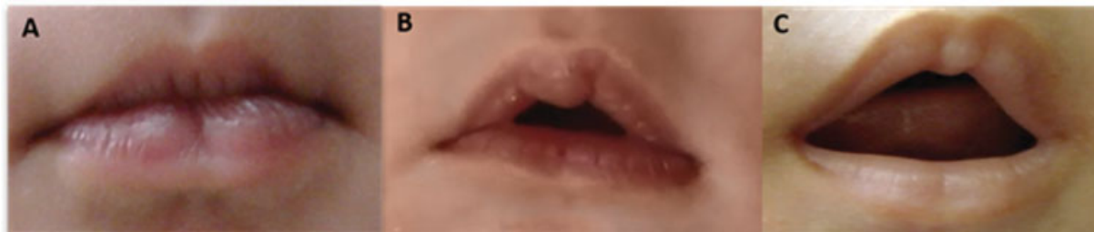
Fig. 1 Lip posture at rest. In A, closed, in B, half-open, and in C, open.

To verify the tongue position at rest, the maneuver described by Martinelli et al. 14 was performed. Facing each infant, the evaluator opened the mouth of the infant and raised the lateral margins of the tongue using the right and left gloved index fingers while the gloved thumb was positioned on the chin