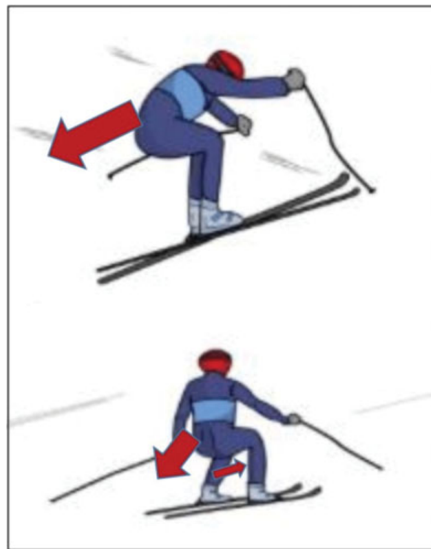
Fig. 3 The skier lands from the jump with a backward balance. A sudden anterior drawer is generated along with a femoral-tibial compression force, resulting in anterior cruciate ligament injury.