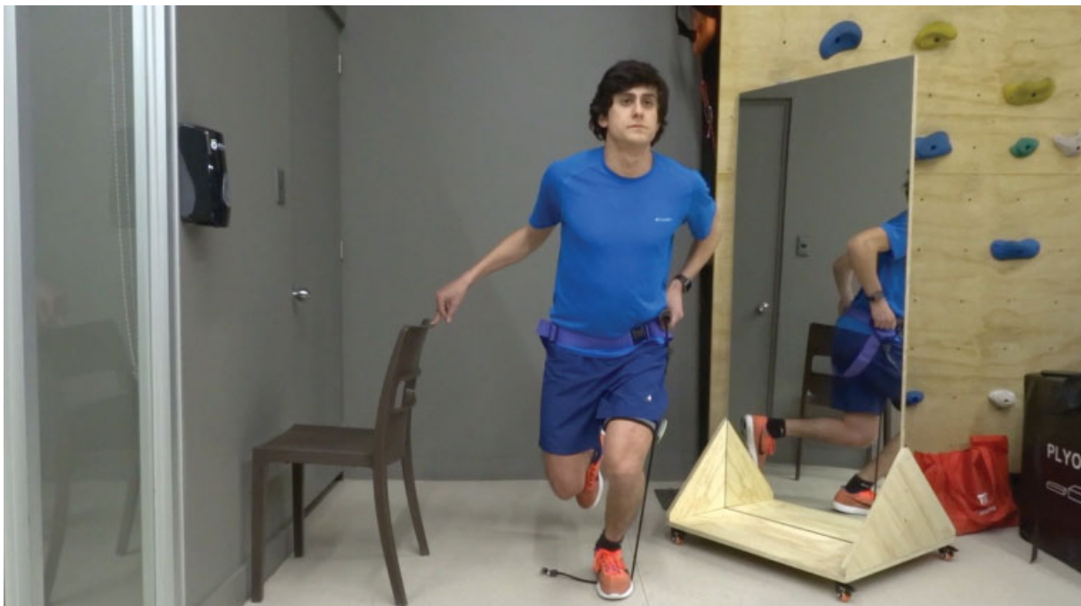
Fig. 6 Patient performing the Vail Sport Test as an evaluation to resume the practice of sports.

Functional braces are recommended when skiing is resumed because they reduce the risk of re-rupture in patients submitted to ACL-R. However, braces are not recommended for skiers with no previous injuries due to the lack of a protective function.