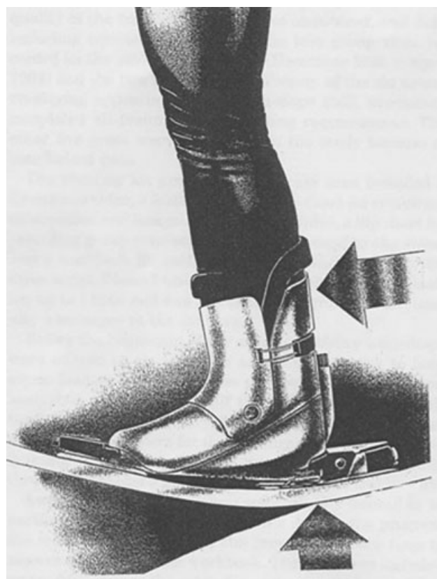
Fig. 2 When the skier loses balance, weight is carried back, resulting in knee extension. This transfers forces from the boot, generating an anterior tibial translation that leads to the injury.