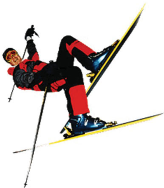
Fig. 1 The skier loses balance on the skis, resulting in deep knee flexion, weight loading on the inner edge, and ski trapping in the snow, leading to an internal tibial rotation that causes the injury.

As previously described, valgus deformity and/or internal rotation are the main mechanisms for ACL injury.