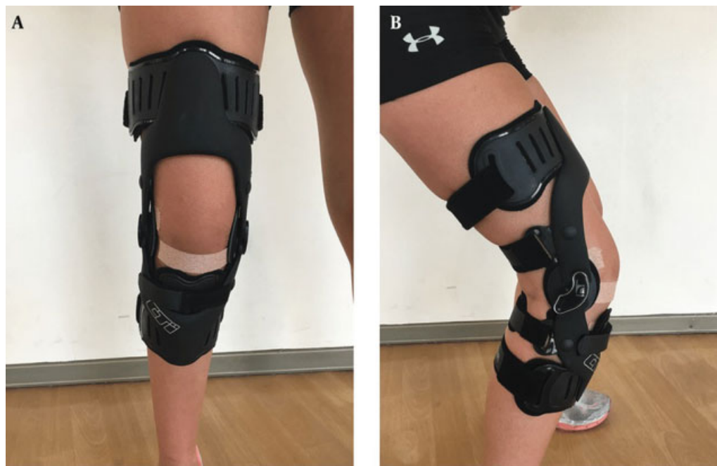
Fig. 7 Competitive skier patient undergoing anterior cruciate ligament reconstruction and demonstrating the use of functional knee bracing.