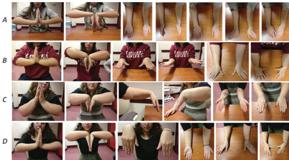
Fig. 6 Clinical photograph of postoperative wrist and forearm mobility. A - patient submitted to a bilateral surgical procedure; B - patient submitted to a bilateral surgical procedure; C - patient submitted to a surgical procedure on the left wrist; D - patient submitted to a surgical procedure on the right wrist.

Abbreviations: \Delta , variation; DASH, Disabilities of the Arm, Shoulder and Hand; VAS, visual analog scale.