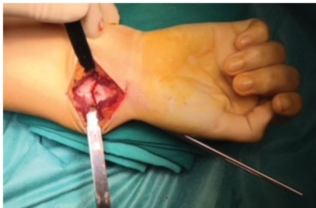
Fig. 4 Osteotomy at the distally concave dome of the metaphyseal region of the distal radius with curved osteotomes.

Reduction and fixation were confirmed fluoroscopically (►Figure 5). The K wires were folded and cut, leaving an end outside the skin to allow their removal during a medical visit. A limited volar fasciotomy was performed prophylactically, and closure began by partially reapproximating the pronator quadratus flap with absorbable sutures. Subcutaneous tissue and skin were closed with absorbable sutures. The limb was immobilized with a split short arm plaster cast to prevent postsurgical edema/compartament syndrome.