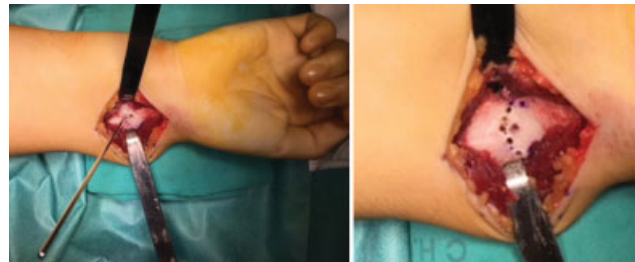
Fig. 2 Dome fenestration of the distal concavity of the volar and dorsal cortex of the metaphyseal region of the distal radius with a Kirschner wire (1.6 mm).

A volar approach to the radius was performed through a longitudinal incision ( \pm 7 cm), exploring the space between the flexor carpi radialis and the radial artery. The pronator quadratus muscle was identified and a distal based "L" flap was elevated to expose the volar face of the radius. The Vickers ligament was identified, divided, and excised ( ►Figure 1 ). Under direct observation and fluoroscopic support, the metaphyseal region of the radius soon to be osteotomized was identified, avoiding damage to the distal radioulnar joint and the radial distal physis (when present). A circumferential radial subperiosteal dissection was performed and the dome (distally concave) fenestration of the distal volar and dorsal metaphysis cortex began using a 1.2/1.6 mm Kirshner (K) wire ( ►Figure 2 ). Two 2.0/2.4 mm K wires were placed percutaneously in parallel or diverging position through the radial styloid and oriented towards the fenestrated region of the osteotomy, without passing beyond it ( ►Figure 3 ). Radial dome osteotomy was performed using curved osteotomes ( ►Figure 4 ); next, a reduction maneuver was performed with longitudinal traction, radial deviation, pronation, and dorsal deviation of the distal fragment. While the main surgeon sustained this reduction, the assistant surgeon advanced the K wires through the osteotomy focus up to the cortical fixation at the proximal fragment.