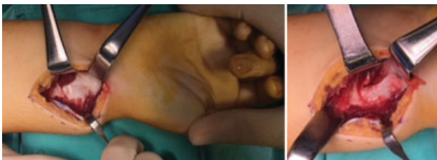
Fig. 1 Volar approach to the radius for identification, section, and excision of the Vickers ligament.

The patient was placed in the supine position, and antibiotic prophylaxis was administered (usually with intravenous