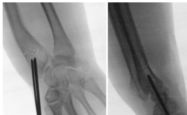
Fig. 3 Introduction of two Kirschner wires (2.0/2.4 mm) parallel or divergent to each other at the level of the radial styloid, towards the metaphyseal region of the previously fenestrated distal radius, without passing beyond it.