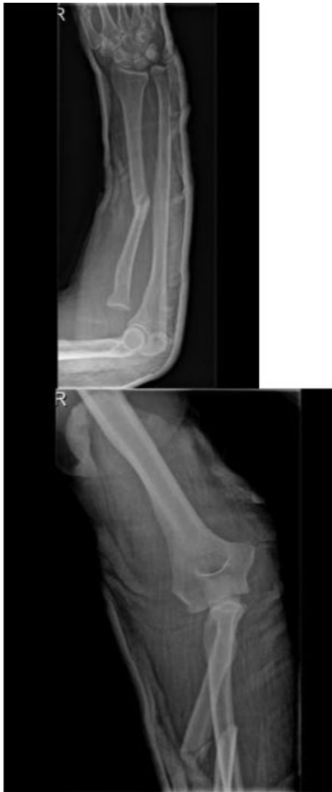
Fig. 2 (A) Radiograph of the fracture at the emergency room with anteroposterior and lateral cast.

patient with a distal radial fracture and posterior elbow dislocation, proposing it as a type-V injury per the Bado classification system. However, other authors do not agree with including this type of fracture among the Monteggia-like injuries due to the lack of ulnar shaft fracture.