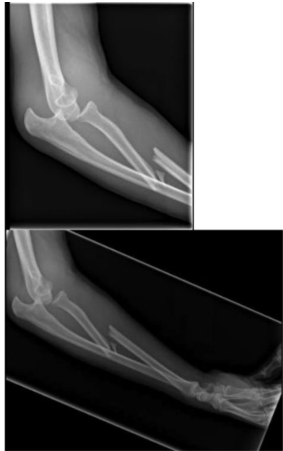
Fig. 1 Prereduction radiological images taken upon the arrival of the patient at the emergency room.

In a delayed manner, the patient underwent surgery. Using an expanded Henry approach, open reduction and internal fixation of the radius shaft fracture were performed with a 7-hole, 3.5-mm locking compression plate (LCP, Synthes, Solothurn, Switzerland); the anatomical reduction of the fracture was confirmed by arthroscopy. Next, repeated maneuvers for closed reduction of the radial head were unsuccessful, leading to a Kaplan approach to the radial head. Several attempts for open reduction of the radial head were met with great resistance, with the radial head resuming its anteromedial dislocation when the posterolateral traction required for reduction was suspended. After carefully examining the field, we observed that the distal insertion of the biceps tendon was surrounding the radial neck in 360°, preventing the reduction (→Figure 2). Given these findings, the biceps tendon was reduced to its anatomical position, followed by an immediate, spontaneous reduction of the radial head. The elbow was explored, revealing stability at flexion-extension and pronation-supination. Finally, the lateral collateral ligament was repaired using three 3.5-mm harpoons. The ruptured capsule was also repaired, and correct joint congruence and elbow stability were verified on arthroscopy.