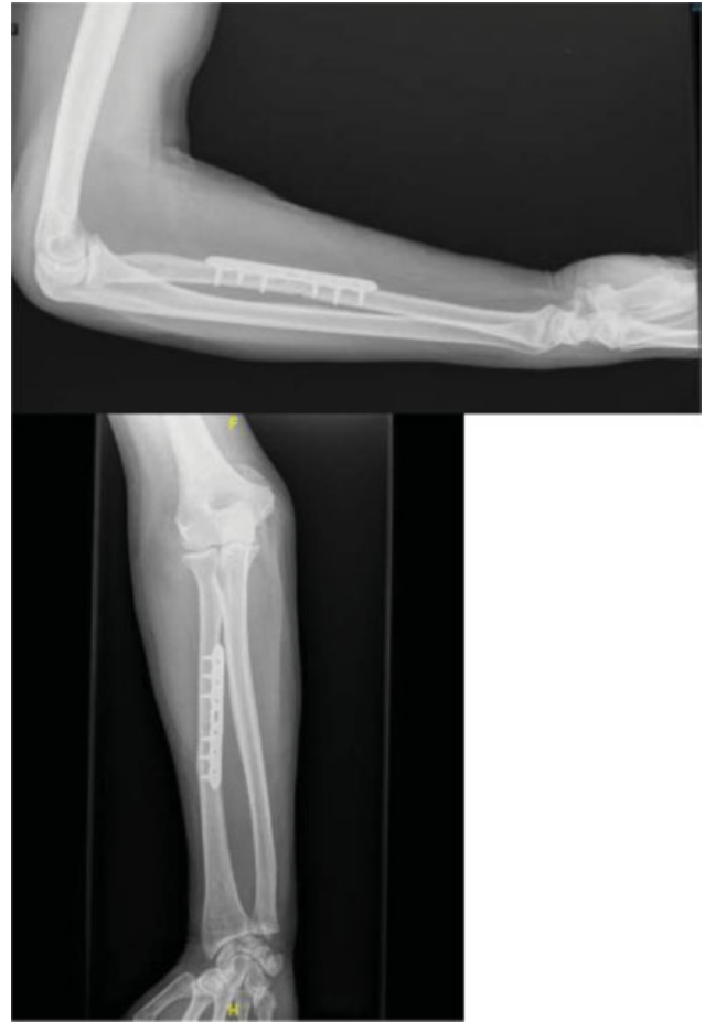
Fig. 5 Osteosynthesis of the radius shaft fracture with a 3.5-mm anteroposterior and lateral locking compression plate.

immobilization and early rehabilitation. Like us, other authors 9 believe that, if a stable reduction of the elbow is achieved after reduction of the radial head, there is no clear indication for surgical repair of the radial collateral ligament. In our case, closed reduction of the radial head was not possible due to the interposition of the long head of the biceps around the neck of the radius, a fact never discussed in adults so far in literature.