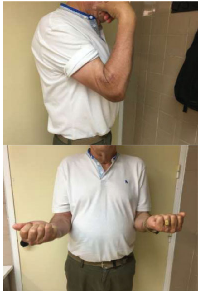
Fig. 3 Patient mobility three months after the intervention.

The literature does not describe a clear mechanism for this injury. Some authors, such as Osborne and Cotterill, 5 advocate that this mechanism consists of a compressive axial force with the elbow slightly flexed, while others, such as Soon et al., 6 defend that this injury results from a fall with a hyperextended arm, radial deviated wrist, and hyperpronated forearm. Therefore, after the present review, we assume that, in our case, what happened was a low-energy