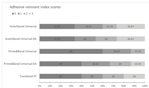
Fig. 2 The frequencies of adhesive remnant index (ARI) scores (%) observed using light microscopy (DA, double application).

development of the direct bonding technique, the time spent in the clinic for bracket bonding has shortened, thus obtaining a more aesthetic and hygienic orthodontic treatment. 23 Nowadays, the direct bonding technique with light-curing adhesives for bonding orthodontic brackets is widely used. The bonding strength of adhesives must be able to withstand the bite forces, the tension of the arch wires, and the patient's harmful mouth habits. According to Reynolds, 24 the bonding strength is sufficient between 5.9 and 7.8 MPa for orthodontic treatment. The shear bond strength of the bracket to enamel must be high enough for preventing bracket debonding during treatment, but it must not cause any enamel damage during debonding. 2,5 It has also been reported that the enamel fractures might be formed when the shear bond strength was higher than 14 MPa. 25