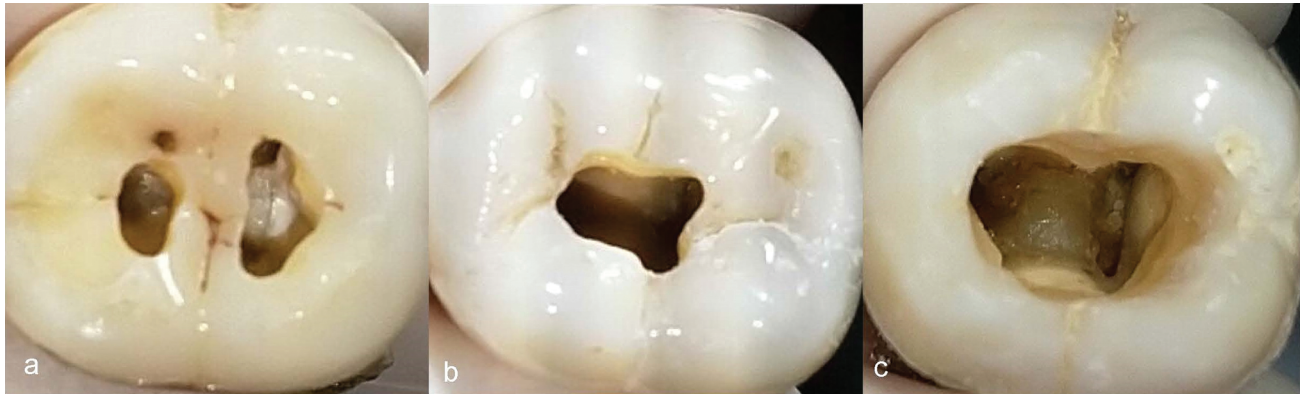
Fig. 1 Access cavity designs for each group: (A) Truss access cavity; (B) Conservative access cavity; (C) Traditional access cavity.

procedure the teeth were handled using a moistened gauze to avoid dehydration of the samples.