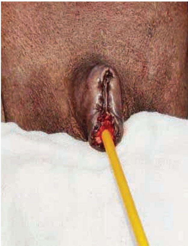
Fig. 2 Postoperative image showing intact urethra and catheter insertion.

occlusion and ischemia of tissues. 1 The patient being reported had all the three comorbidities most likely contributing to severe decrease in penile blood flow.