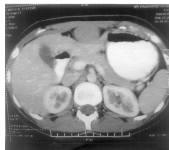
Figure 1: CT scan of recurrent anterior abdominal wall dysgerminoma posterior to the rectus sheath.

Serum CA-125, AFP and CEA were normal. Standard staging laparotomy with right salpingo-oophorectomy was done. The histopathology report of right ovarian mass showed dysgerminoma, stage IA. As per our hospital policy, the patient was kept under close observation. \beta -HCG level came down to normal after surgery.