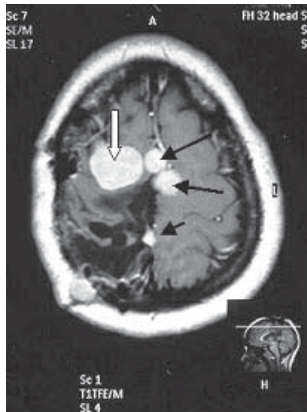
Fig-2 Axial ,gadolinium enhanced T1 weighted image reveals , multiple, lobular extra axial mass lesions showing homogenous enhancement in a parafalcine location ( solid arrow) and along dura over right parietal location ( open arrow).