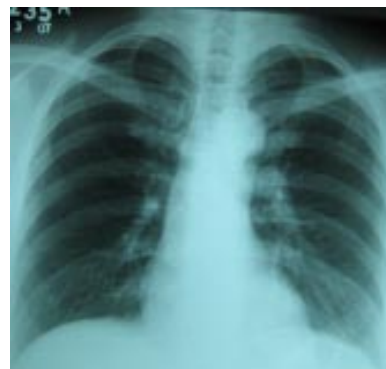
Fig 1B: post operative chest X ray showing resolution of pleural effusion