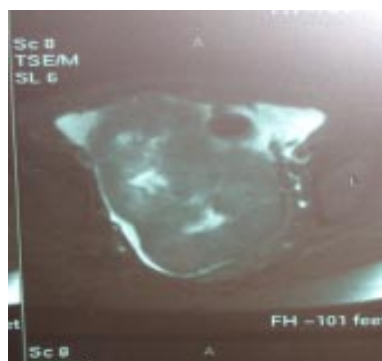
Fig 2: MRI pelvis showing heterogenous pelvic mass