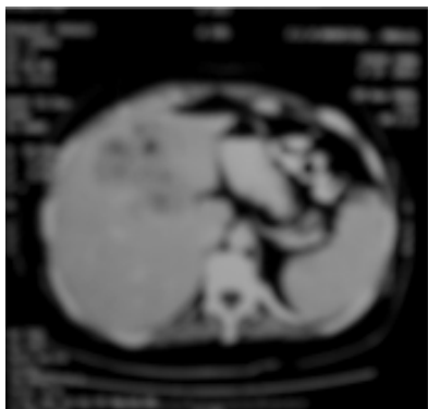
Fig 1: CT abdomen showed a 9x9x8.6cms mass in the left lobe of liver with heterogeneous enhancement.

She was treated symptomatically and was advised about the different treatment modalities available along with the outcome of each of them. She became symptomatically better but declined to undergo any kind of tumour related therapy. Patient expired a few months later.