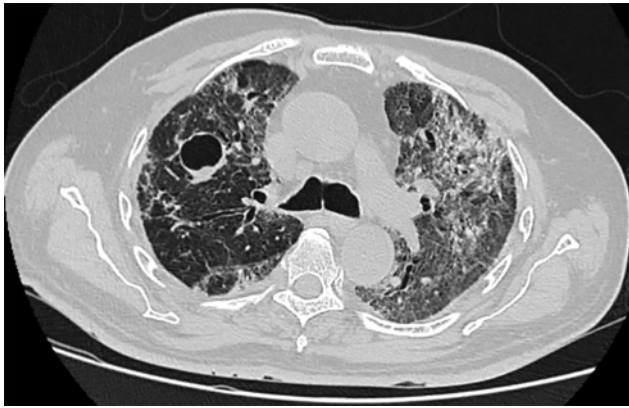
Fig. 4 CT scan at the time of discharge showing a cavitory lesion of size 2.3 x 2.5 x 2 cm that was increased in size compared with the previous CT scan along with fibrotic bands and traction bronchiectasis.

his condition was improving but in view of a new cavitory lesion bronchoscopic guided lavage was performed and was negative for acid fast bacillus, bacterial, and fungal infection. Serological markers for fungal infection like galactomannan and \beta -1,3-D-glucan were also negative. Gradually patient condition improved, and his oxygen requirement came down with inflammatory markers around normal limits. CT thorax at the time of discharge was showing a cavitory lesion of size 2.3x2.5x2 cm that was increased in size compared with the previous CT thorax along with fibrotic bands and traction bronchiectasis ( ► Fig. 4 ). Hence, patient was discharged with antifibrotics, newer oral anticoagulants, and low-dose steroids with advice of regular follow-up.