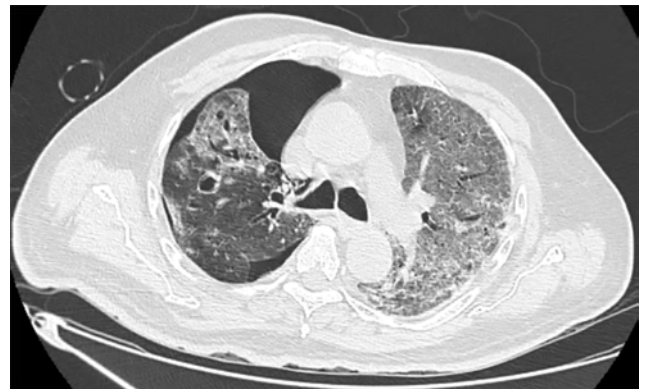
Fig. 3 CT scan showing pneumothorax in right side and a cavitory lesion of size 9 x 10 x 9.5 mm in anterior segment of right upper lobe.