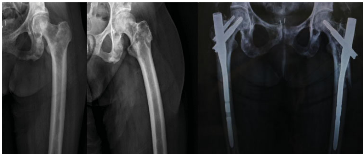
Fig. 2 Metastatic breast cancer lesion in the proximal femur in a 61-year-old patient with transtrochanteric fracture and impending contralateral fracture. The distal locking screw was not necessary due to stabilization with bone cement.

Conservative treatment showed the worst results, with higher morbimortality; thus, surgical treatment is the standard treatment for pathological fractures. 22 Osteosynthesis showed a lower rate of complications when compared with an endoprosthesis, as it allows immediate support. 23 The use of long nails is the most chosen and indicated method, as it prevents future injuries as the disease progresses. The