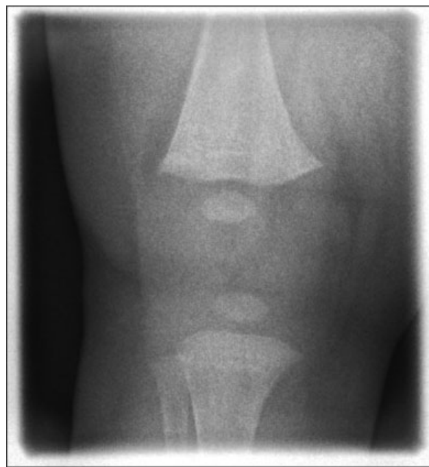
Fig. 2 Anterior–posterior X-ray of the left knee 33 days after the MRI examination. MRI, magnetic resonance imaging.

21 days. Despite the positive blood culture, lumbar puncture was omitted due to lacking clinical signs of meningitis.