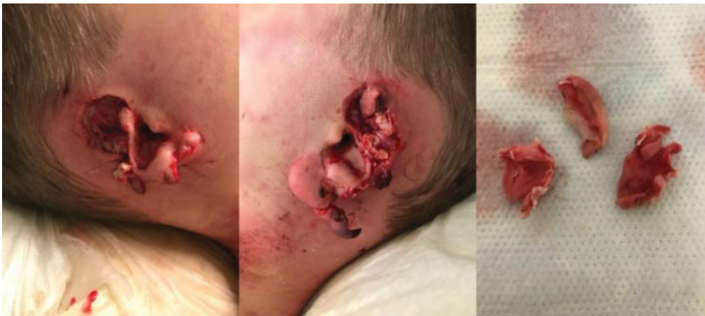
Fig. 3 A significant soft tissue and cartilage amputation from bilateral ears following a dog attack (left, center). The amputated parts were available (right) but given the mechanism and extent of the injury with no identifiable blood vessels for replantation, the decision was made to stabilize the soft tissues and plan for a staged reconstruction.

The management of auricular hematomas requires drainage of the hematoma, hemostasis, and application of a