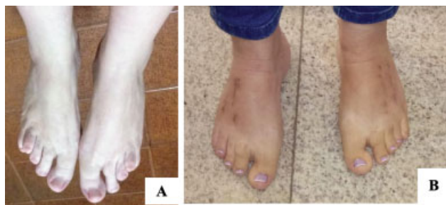
Fig. 5 Preoperative (A) and postoperative (B) clinical aspects of a patient with bilateral brachymetatarsia in the 3 rd and 4 th metatarsi submitted to osteogenic distraction using a monolateral fixator.

Osteogenic distraction is the most accepted and most successful treatment performed by foot and ankle surgeons for metatarsus stretching. 17 The advantages of gradual stretching are the ability to obtain a longer length compared with that obtained by the use of an interim bone graft, allowing immediate weight support and preserving the movement of the metatarsal-phalangeic joint, and the fact that it does not present the need for bone graft, which can generate discomfort in the donor area. 11 These advantages make the technique of gradual distraction the most used method when seeking a stretching > 15 mm or > 25% of the initial size of the metatarsus. 1