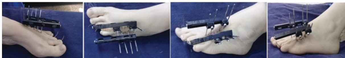
Fig. 4 Postoperative of a patient with a 3 rd and 4 th metatarsi deformity of the left foot submitted to bone stretching with monolateral external fixator.

When evaluating 48 cases of brachymetatarsia, Peña-Martínez et al. 16 observed that the fourth metatarsus was the most affected, representing 98% of the cases, with the third metatarsus representing the other 2%. In the present study, 61.5% ( n=8 ) of the deformities were in the fourth metatarsus, and 38.5% ( n=5 ) were in the third metatarsus (→ Figure 3 ). The chosen technique used a monolateral external fixator associated with the use of Kirschner wires (→ Figures 2 and 4 ), promoting stability in the metatarsophalangeal joint and avoiding deformity in metatarsus flexion during bone stretching.