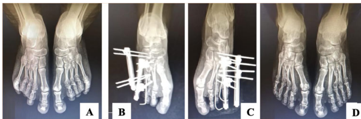
Fig. 1 Radiograph in anteroposterior incidence of the feet with load demonstrating the evolution of a patient with bilateral brachymetatarsia in the 3 rd and 4 th metatarsi submitted to osteogenic distraction. (A) preoperative radiography, (B) postoperative radiography of the right side, (C) postoperative radiography of the left side; and (D) result after 12 weeks of treatment.

patients diagnosed with brachymetatarsia treated between January 2018 and April 2020 and a total of 8 feet and 12 metatarsi.