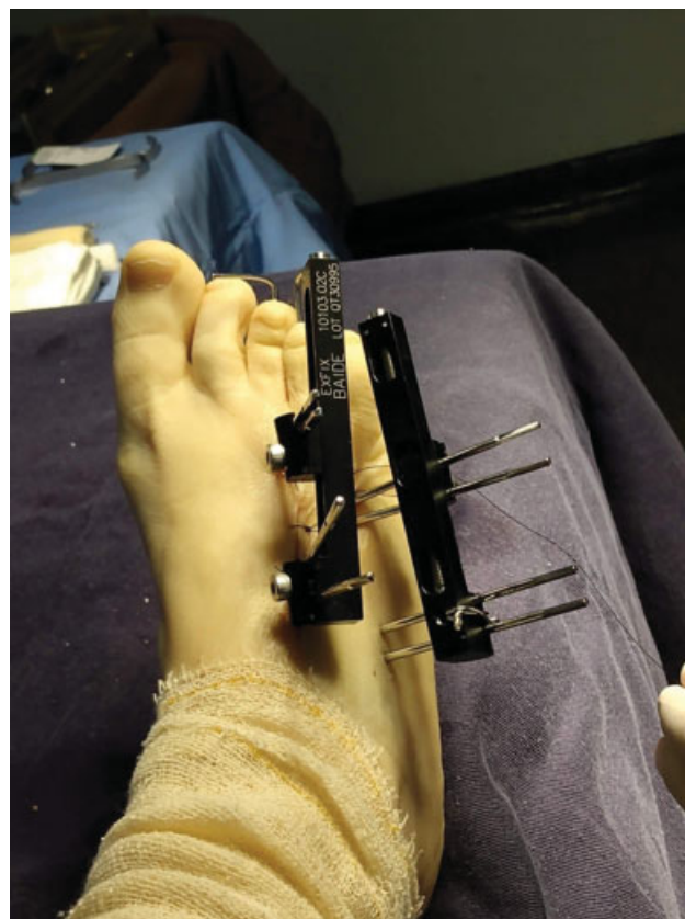
Fig. 2 Monolateral external fixator installed for bone distraction at 45° inclination and intramedullary Kirschner wires.

was conferenced intraoperatively. Next, the metatarsus-phalange joint is fixated with a Kirschner wire 1.5 (→ Figure 2 ) to avoid deformity in phalanx flexion during distraction stretching. After that, the skin incision is closed at the site of corticotomy with nylon 4.0 thread and bandages on the pins. When there it is necessary to place more than one external fixator, the procedure is performed in the same way by carefully observing the distance between the assemblies so as not to hinder distraction and stretching.