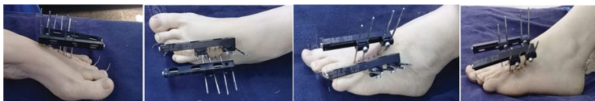
Fig. 4 Postoperative of a patient with a 3 rd and 4 th metatarsi deformity of the left foot submitted to bone stretching with monolateral external fixator.

When evaluating 48 cases of brachymetatarsia, Peña-Martínez et al. 16 observed that the fourth metatarsus was the most affected, representing 98% of the cases, with the third metatarsus representing the other 2%. In the present study, 61.5% ( n=8 ) of the deformities were in the fourth metatarsus, and 38.5% ( n=5 ) were in the third metatarsus ( \rightarrow Figure 3). The chosen technique used a monolateral external fixator associated with the use of Kirschner wires ( \rightarrow Figures 2 and 4), promoting stability in the metatarsophalangeal joint and avoiding deformity in metatarsus flexion during bone stretching.