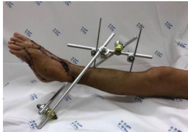
Fig. 2 Delta-type external fixator placed in a patient, with good skin healing.

table. The procedure for the installation of the external fixator began after the completion of the microsurgical flap. The limb was positioned in extension, and fluoroscopy was used to aid the installation of the external fixator.