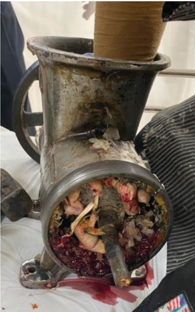
Fig. 6 The right hand caught within the meat grinder, with visible crushing of hand.

workplace, especially for those who are inadequately trained in their proper use. 4