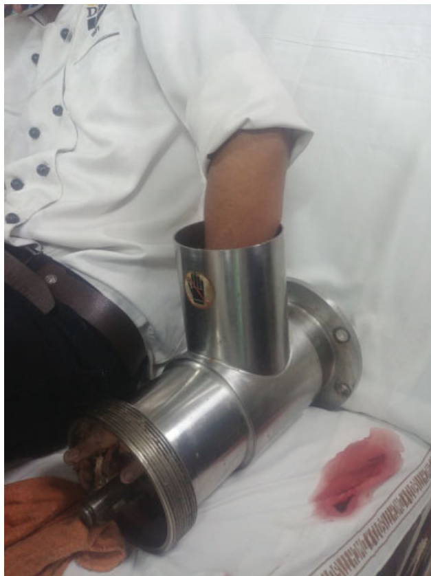
Fig. 1 The left hand caught within the meat grinder.