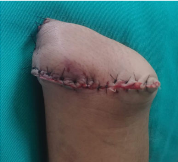
Fig. 5 Postdisarticulation volar view.