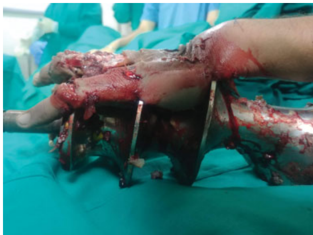
Fig. 2 Lateral view of the left hand after removal of the outer shell.

After an uneventful postoperative period, suture removal was done at 14 days and currently the patient wears a cosmetic prosthesis.