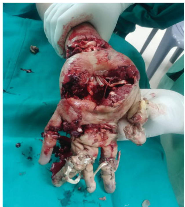
Fig. 4 Palmar view of the left hand after removal of the outer shell.

Loss of just the thumb is equivalent to a 40% loss of hand function and a 25% loss of the whole body. 3