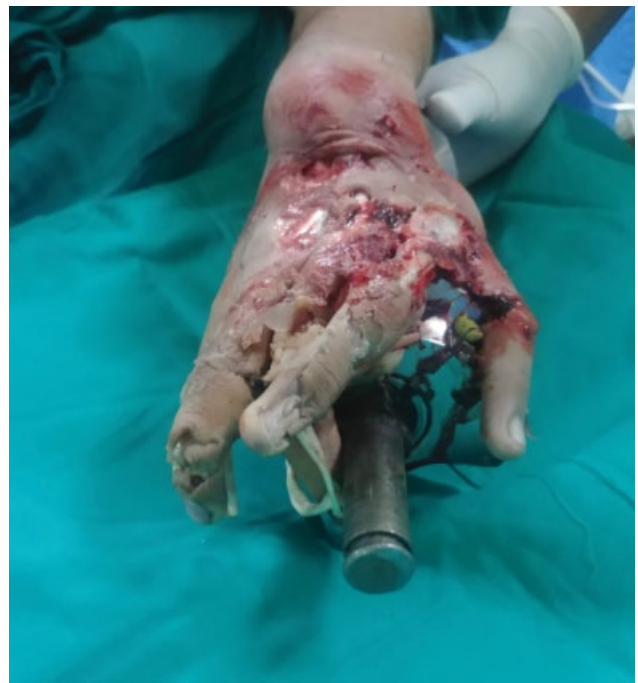
Fig. 3 Dorsal view of the left hand after removal of the outer shell.

Hands are an essential component of our existence. They are not only important for physical and psychological development but also play an essential role in our appearance and our professional career. 2 It is no surprising that injuries to the hands can have devastating consequences for an individual.