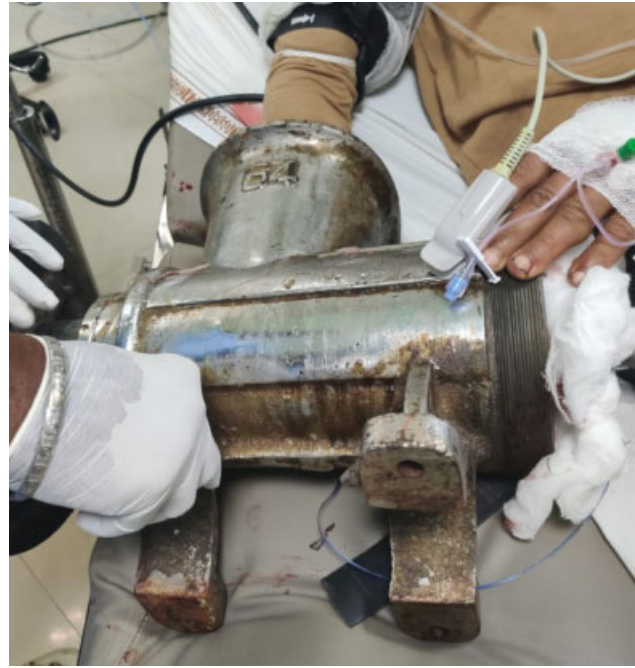
Fig. 7 The right hand caught within meat grinder.