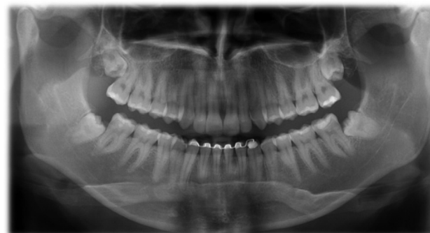
Fig. 1 Panoramic radiography, third molar retained.

Regarding the evaluation of edema over time, it was observed that the mean edema in all periods was lower for Group A, with a significant difference in each of these periods: preoperative ( p = 0.00 ), 24 hours ( p = 0.03 ),