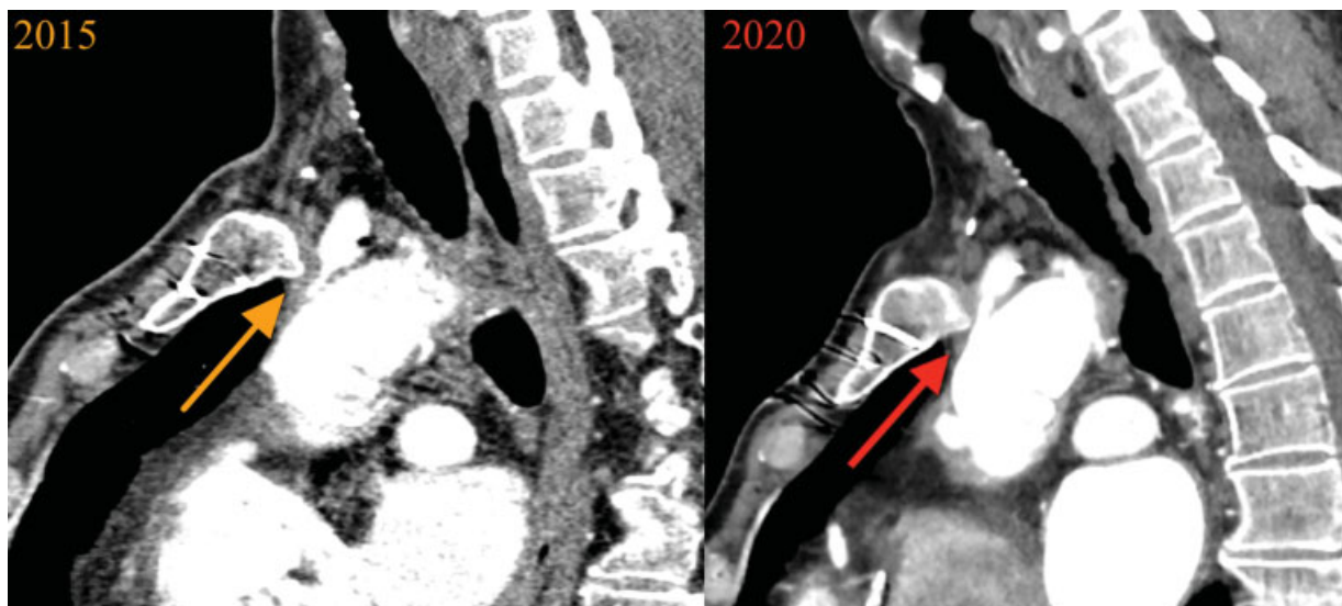
Fig. 2 Sagittal thoracic computed tomography scan images illustrating brachiocephalic artery compression by a sternal osteophyte that formed following open aortic surgery.

To augment and secure brain perfusion, a left subclavian to left carotid bypass is planned, so as to avoid a dangerous redo sternotomy. This would allow the use of the preexisting carotid-to-carotid bypass to allow bihemispheric cranial flow.